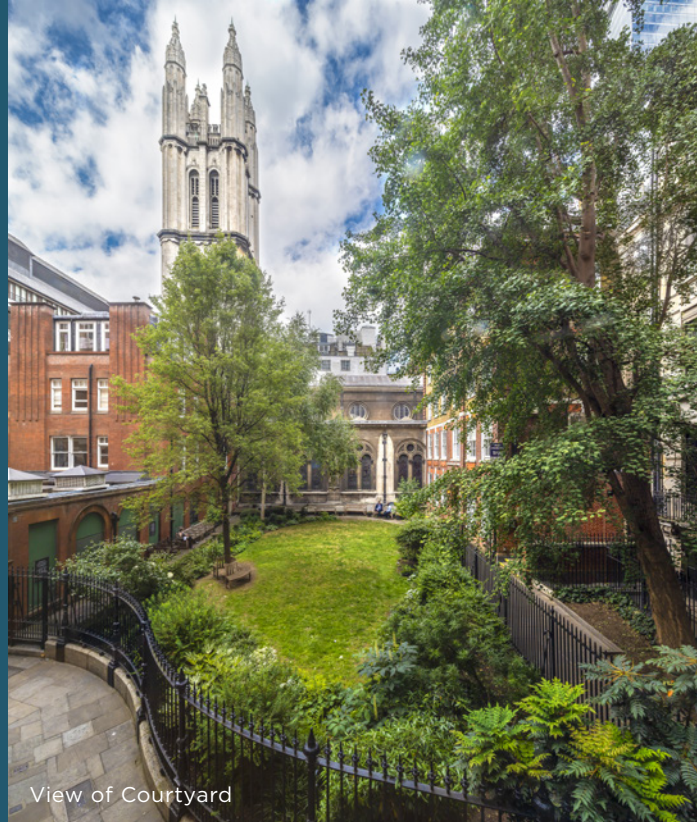
View of Courtyard

1 George Yard provides 2,563 - 5,180 sq ft of premium office space across the 1st and 4th floors. Both floors feature a modern fit-out, including multiple meeting rooms, kitchens, breakout areas, and open-plan workstations.