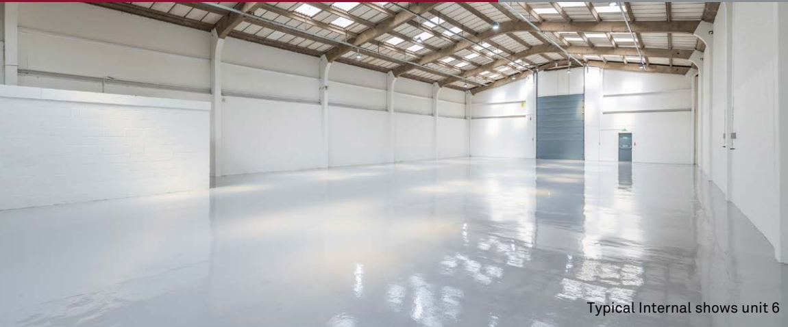
Typical Internal shows unit 6

Units 3–6 form a terrace that can be leased either as a whole or as individual units. At present, Units 3 and 4 are combined, while Units 5 and 6 remain separate.