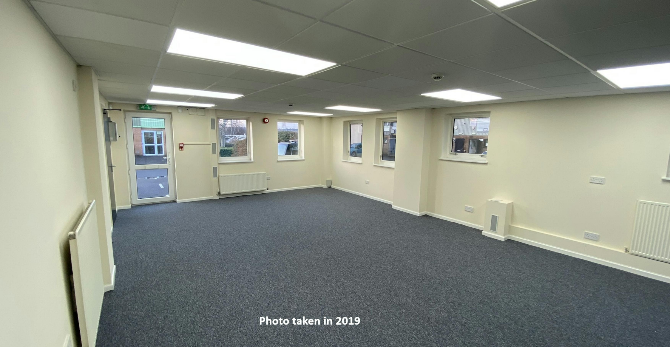
Photo taken in 2019