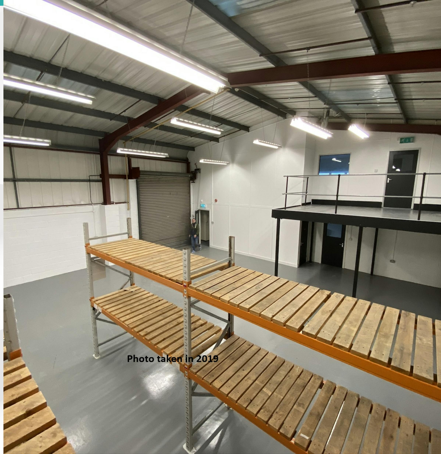
Photo taken in 2019