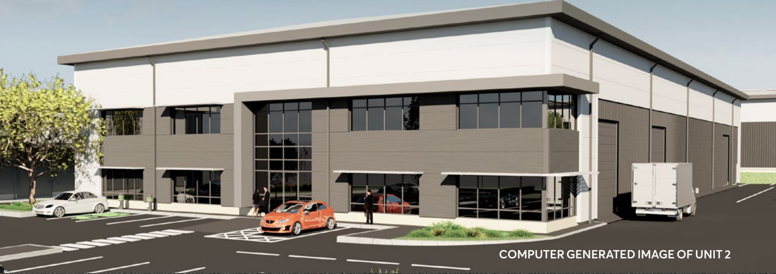
COMPUTER GENERATED IMAGE OF UNIT 2