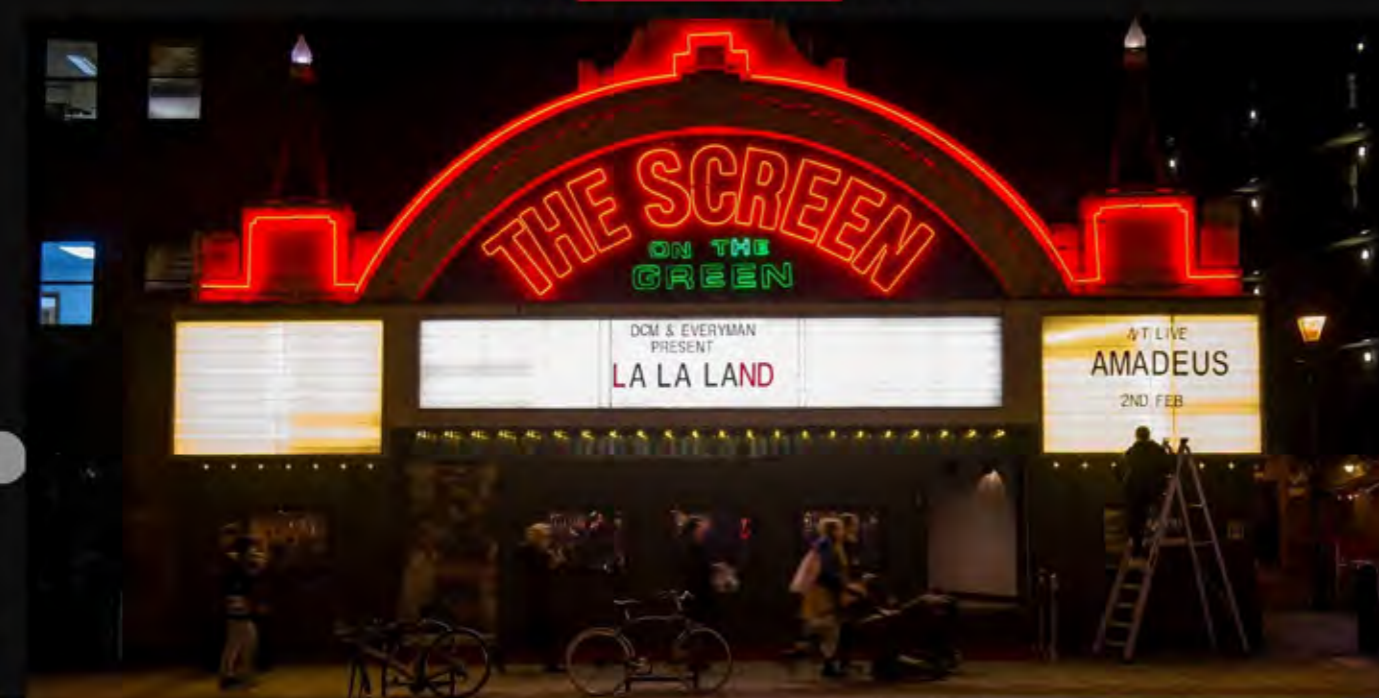
THE SCREEN ON THE GREEN