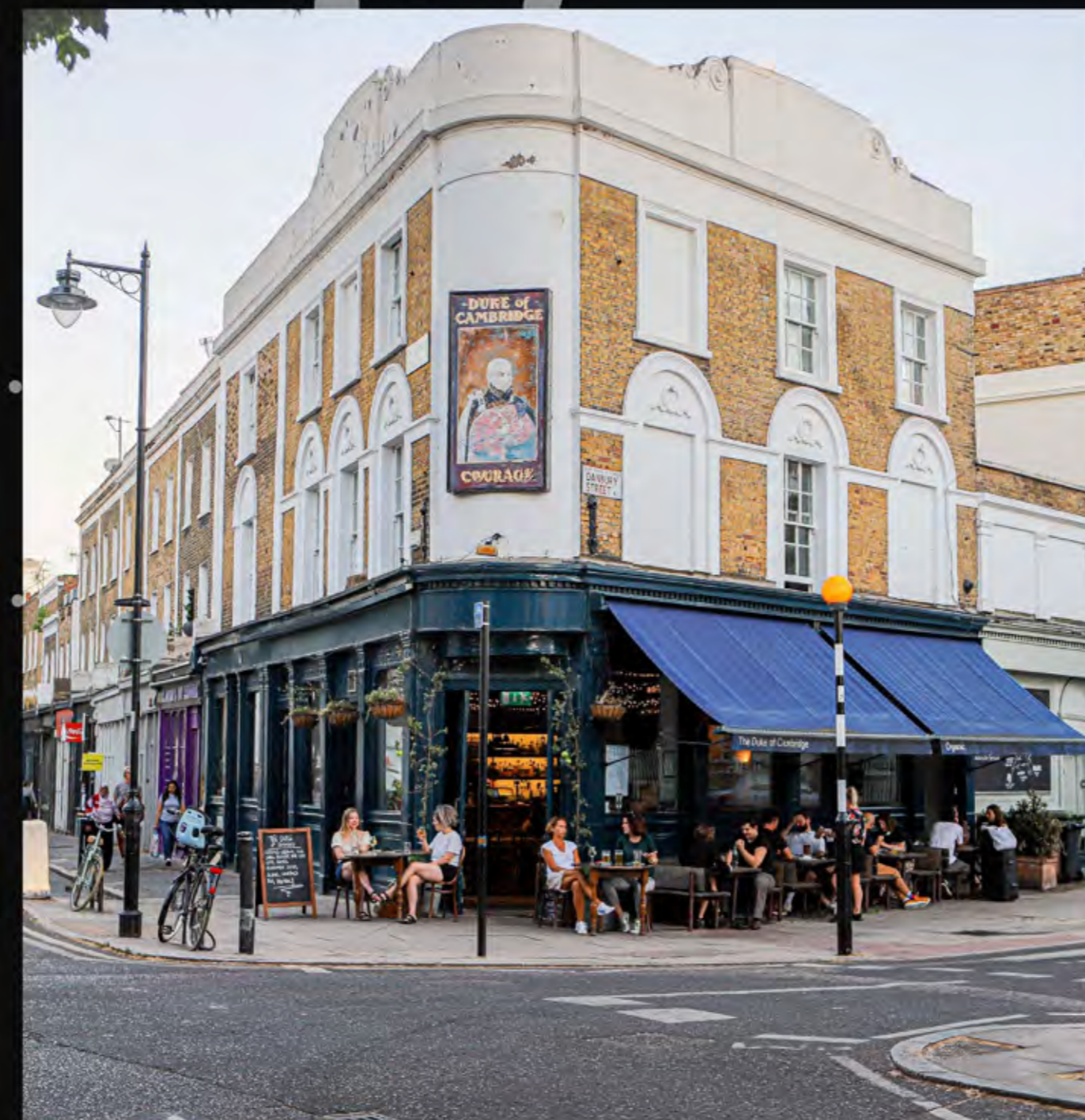
THE DUKE OF CAMBRIDGE