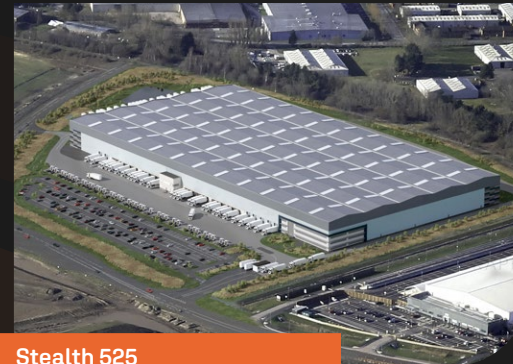
Stealth 525 Welsh Road Northern Gateway Deeside CH5 2RD