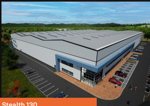
Stealth 130 Welsh Road Northern Gateway Deeside CH5 2RD