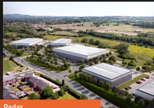
Radar Radway Green Crewe J16 M6