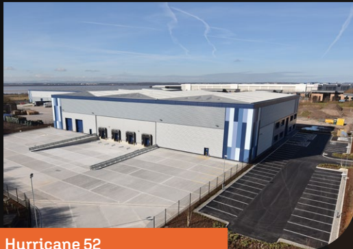
Hurricane 52 Estuary Business Park South Liverpool L24 8RF