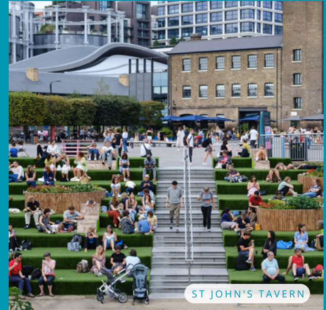
ST JOHN'S TAVERN