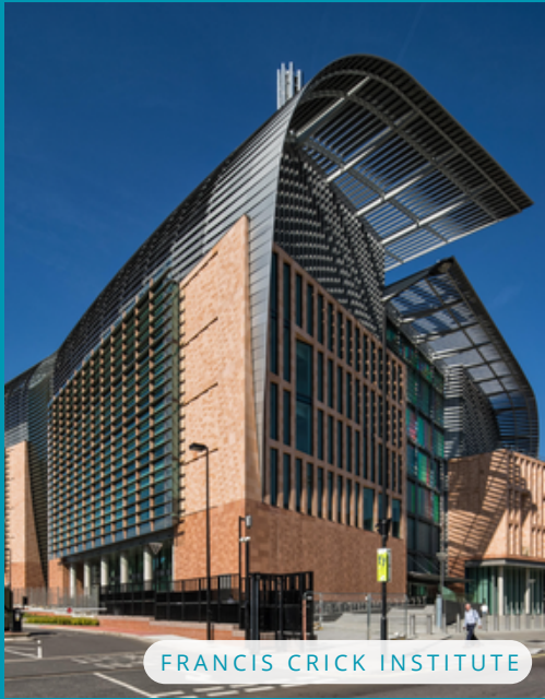
FRANCIS CRICK INSTITUTE