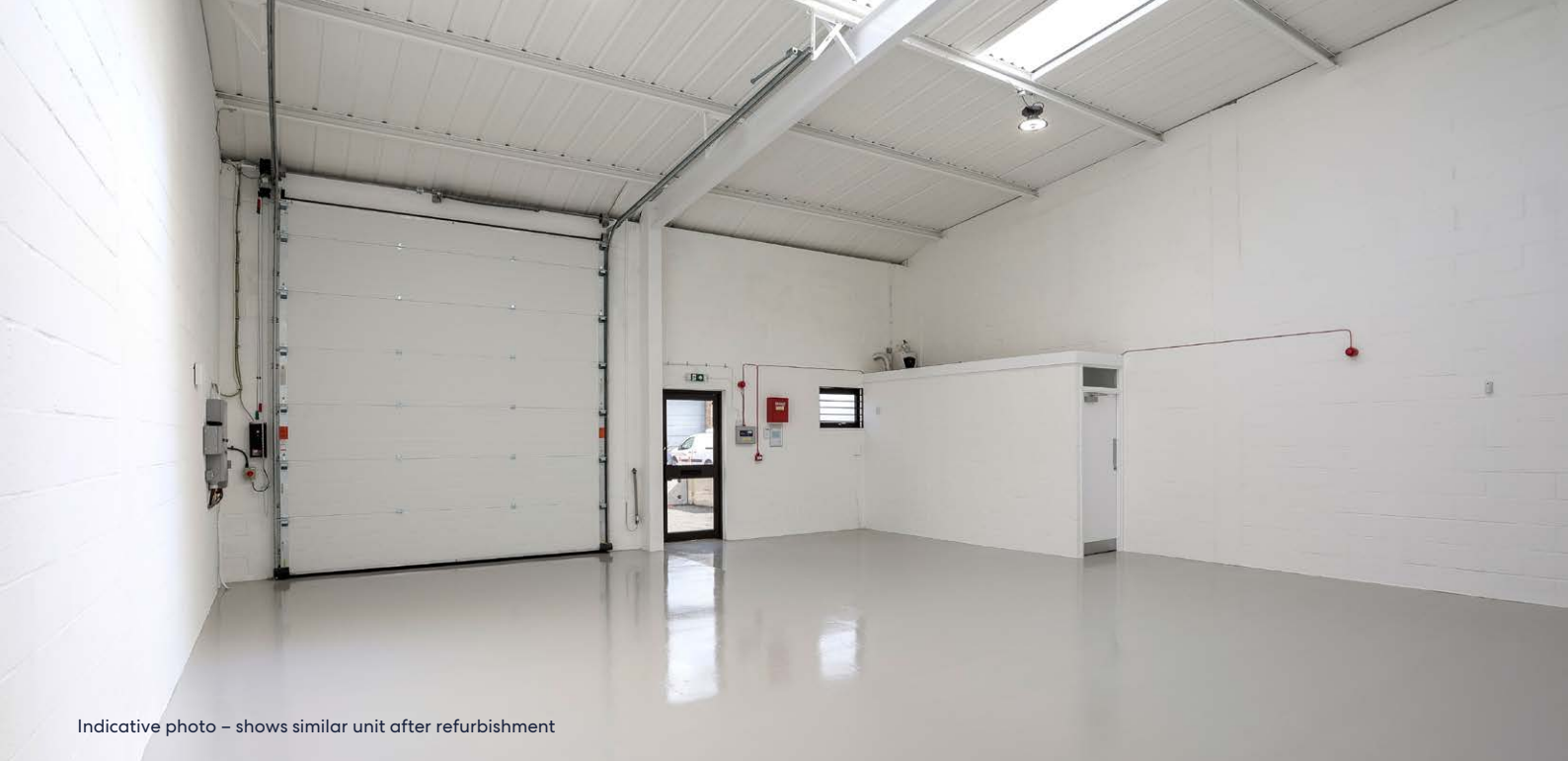
Indicative photo – shows similar unit after refurbishment