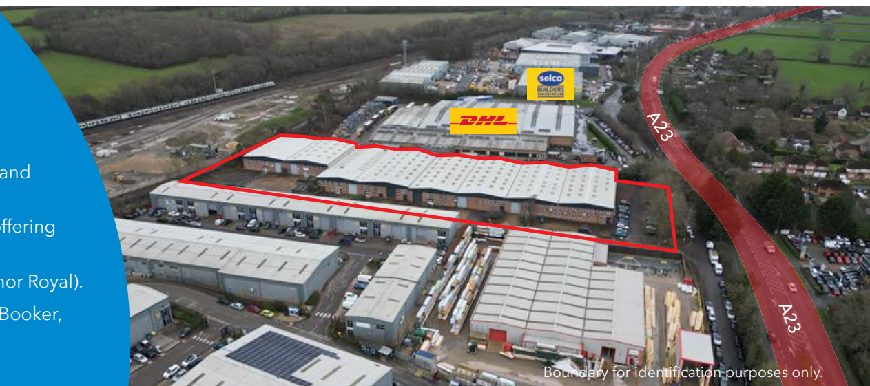
Boundary for identification purposes only.