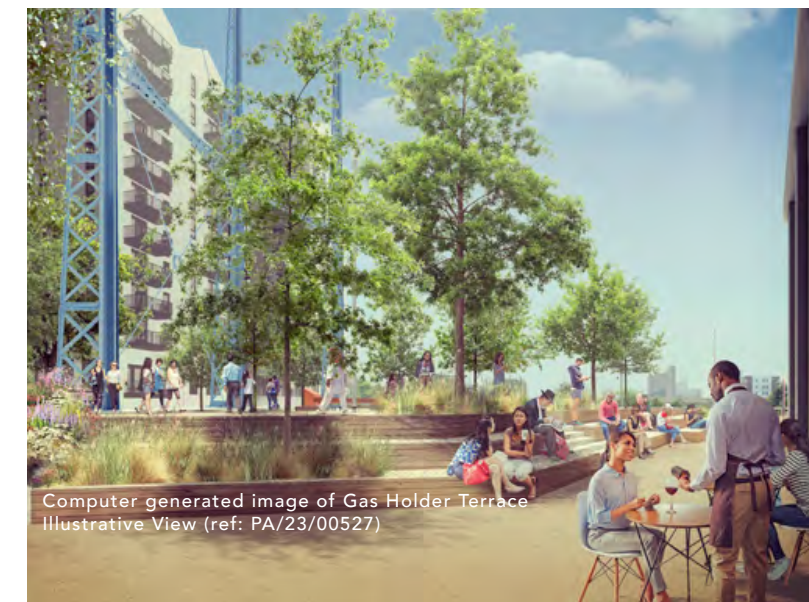
Computer generated image of Gas Holder Terrace Illustrative View (ref: PA/23/00527)