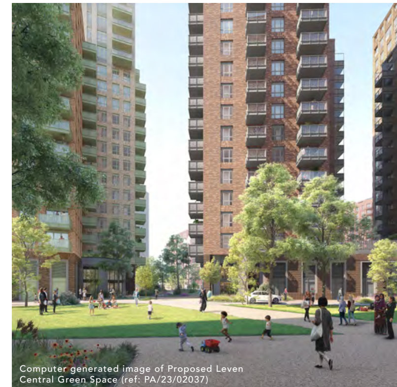
Computer generated image of Proposed Leven Central Green Space (ref: PA/23/02037)