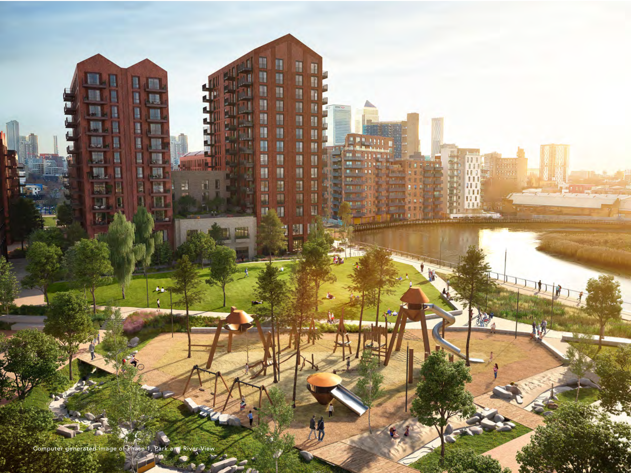
Computer generated image of Phase 1, Park and River View