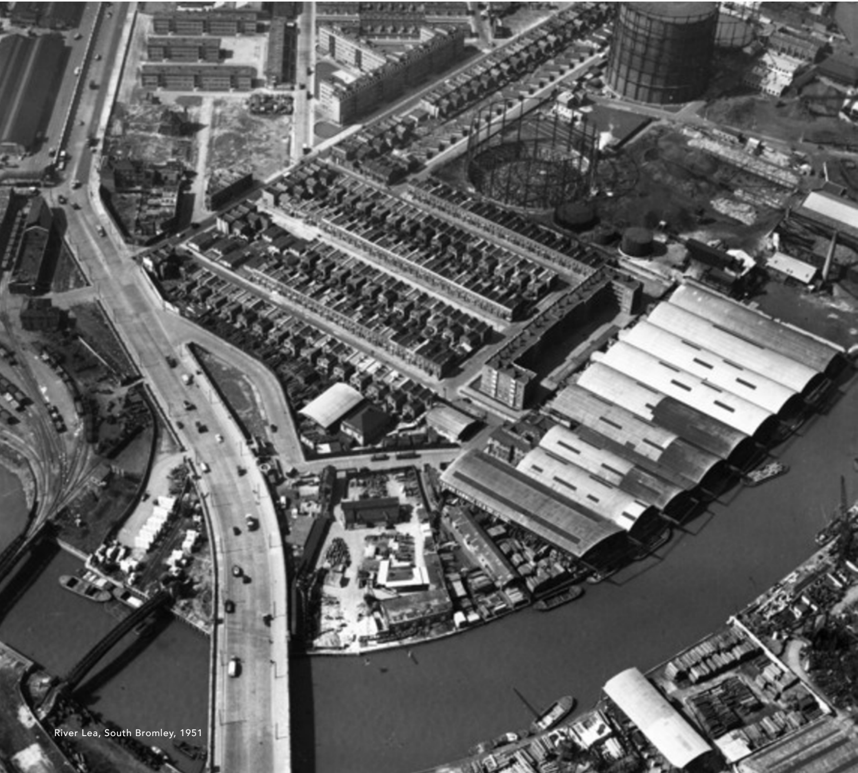
River Lea, South Bromley, 1951