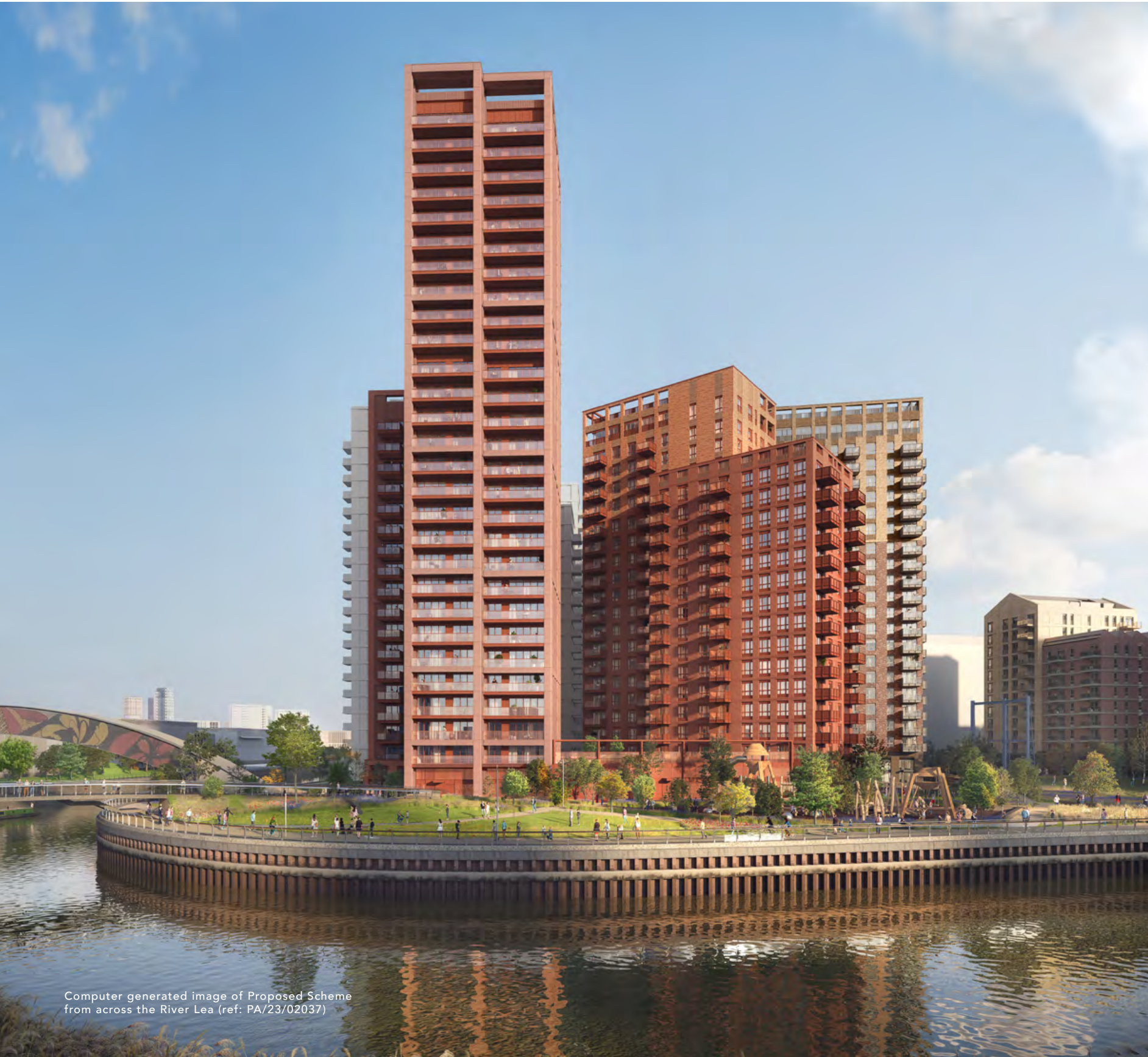
Computer generated image of Proposed Scheme from across the River Lea (ref: PA/23/02037)