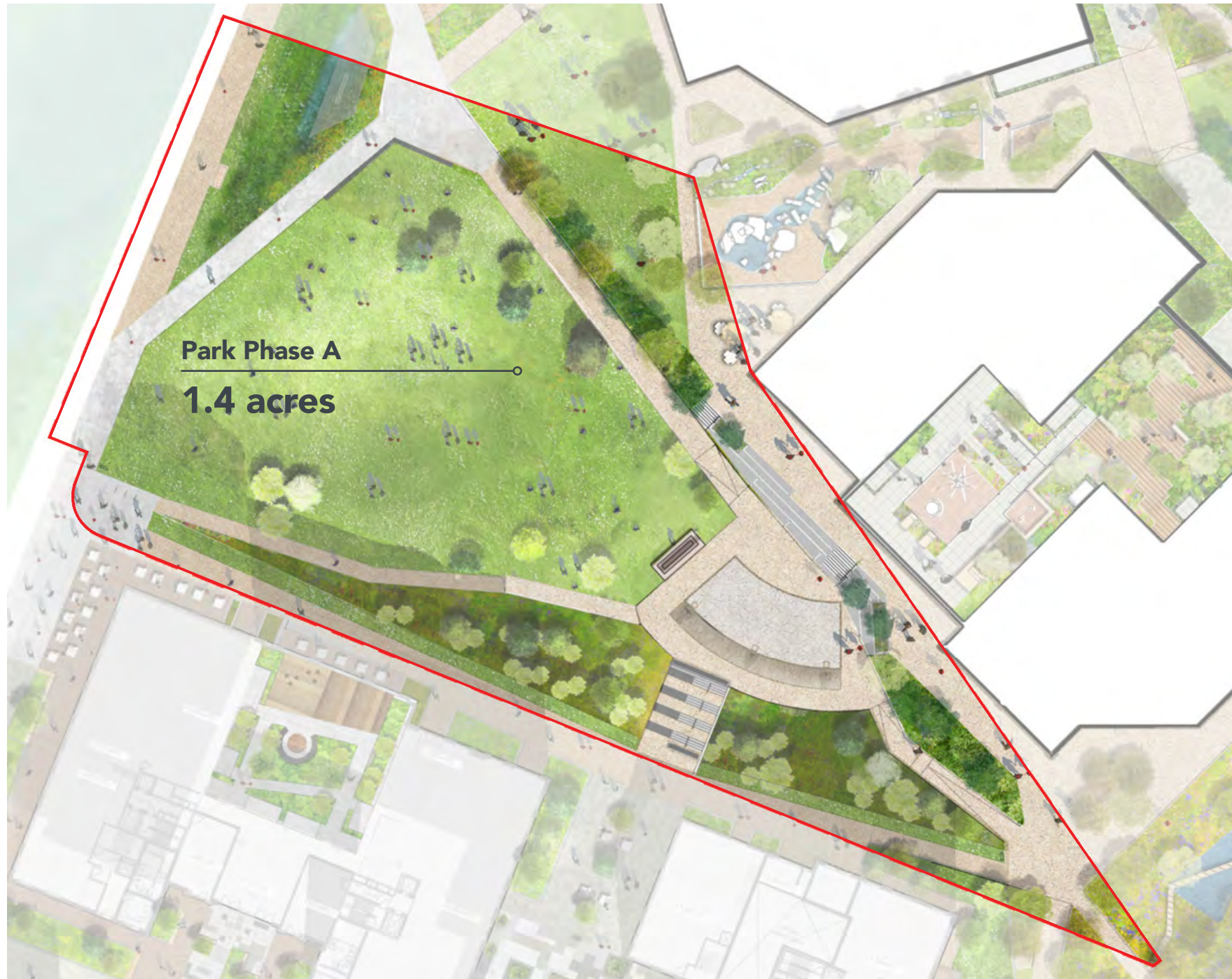
Site Plan of Poplar Riverside consented Masterplan (ref: PA/18/02803)