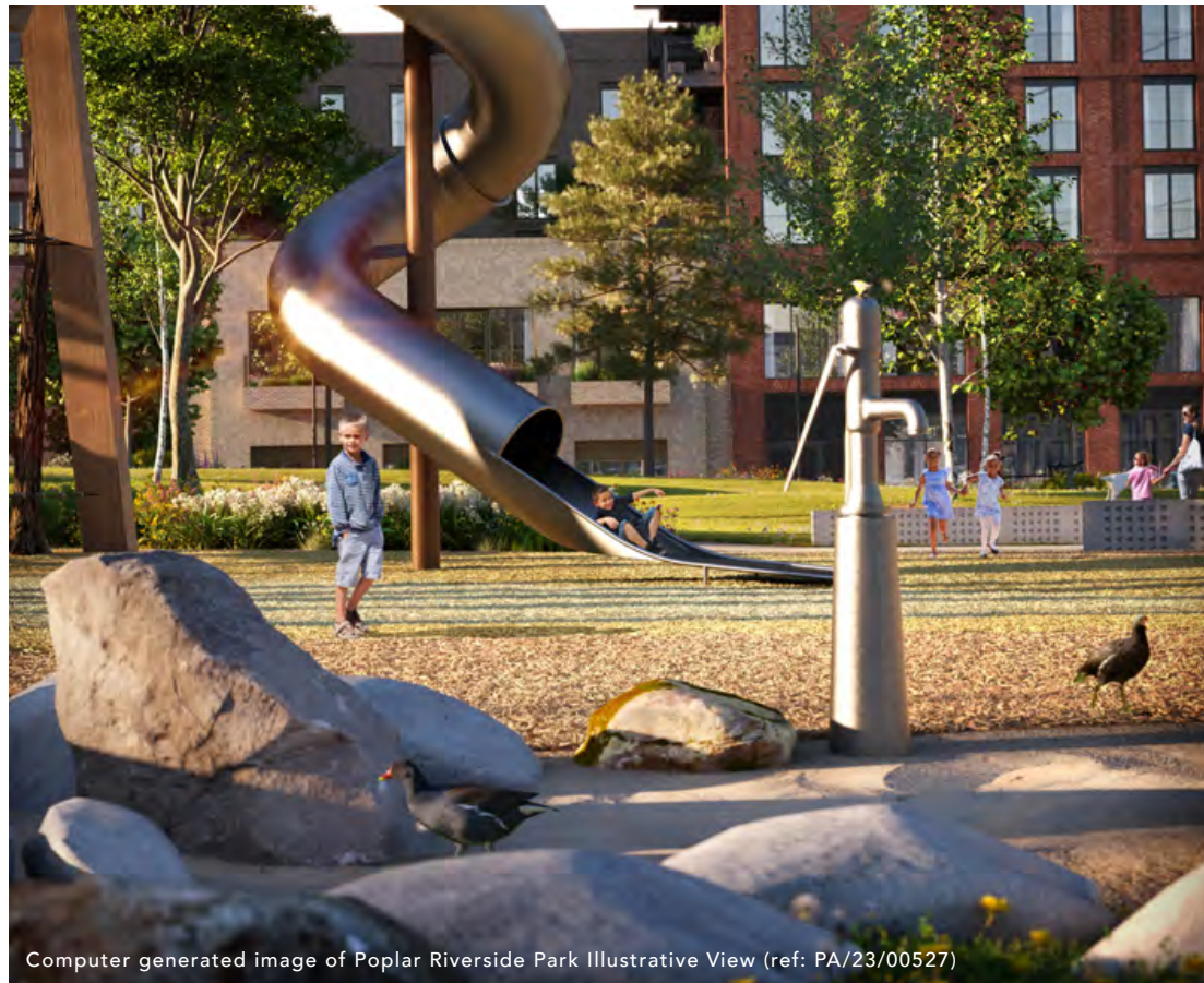
Computer generated image of Poplar Riverside Park Illustrative View (ref: PA/23/00527)

Our Vision 2030 is our ten year plan which sets out how we will achieve this.