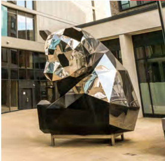
Hendo is the largest panda at 4 metres tall and approximately 1,350 kg. Named after our famous relish.