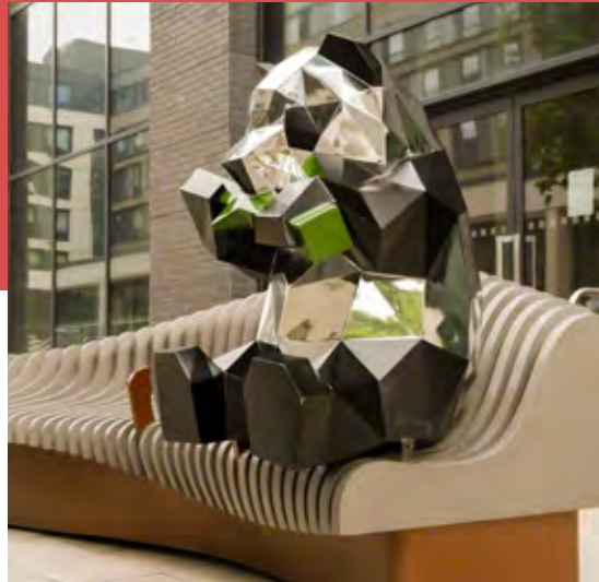
Little Mester sits on a bench. His name remembers the term given to master craftsmen in Sheffield's cutlery industry.