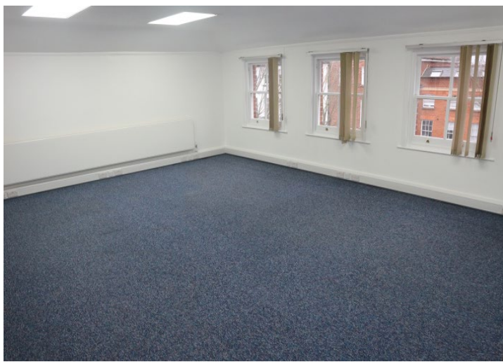
2nd Floor - Front Suite