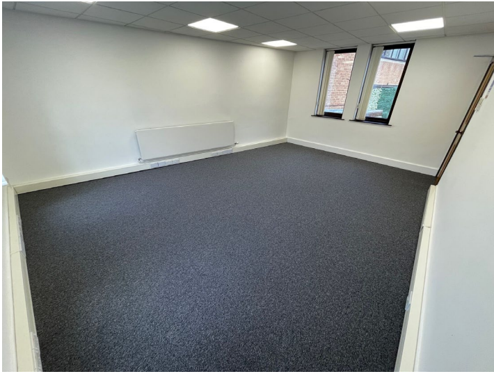
1st Floor Suite