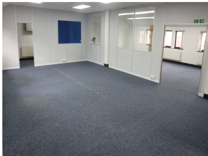
2nd Floor - Rear Suite