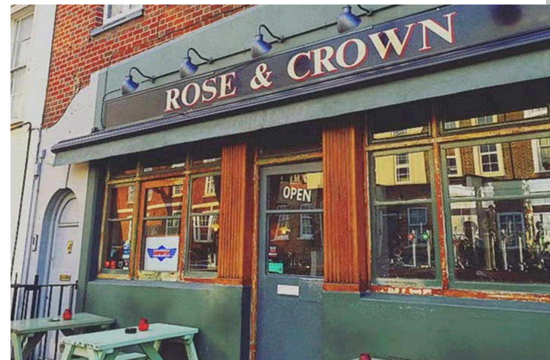
Rose & Crown