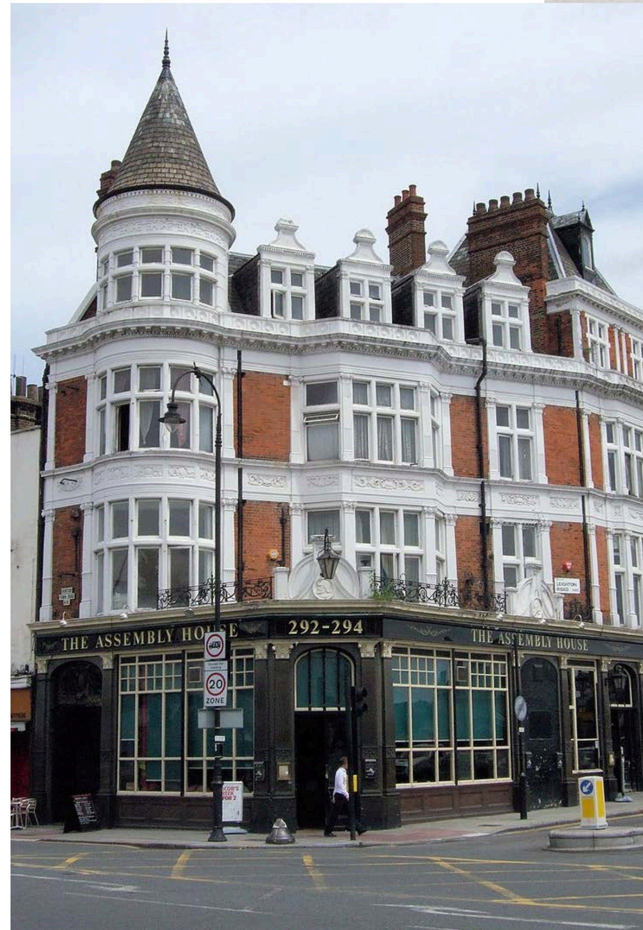
The Assembly House