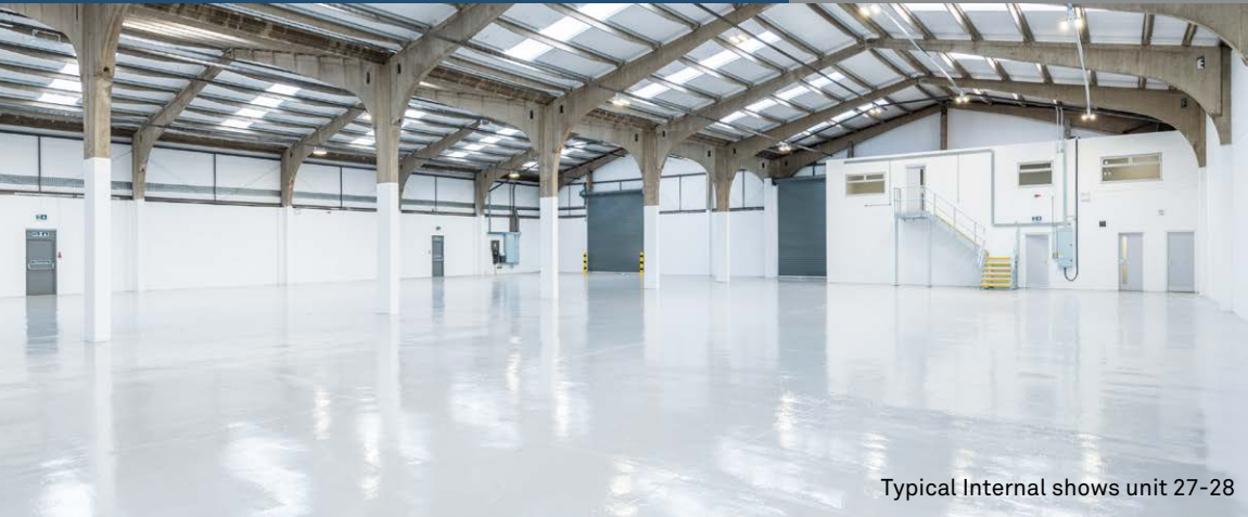
Typical Internal shows unit 27-28

Units 15 and 16 are currently opened up to form a single unit with access to the east. Units 17 and 18 are individually split. There is flexibility to take the accommodation as a whole or in part