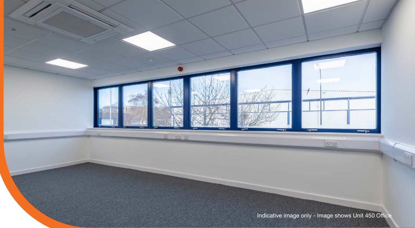
Indicative image only - Image shows Unit 450 Office