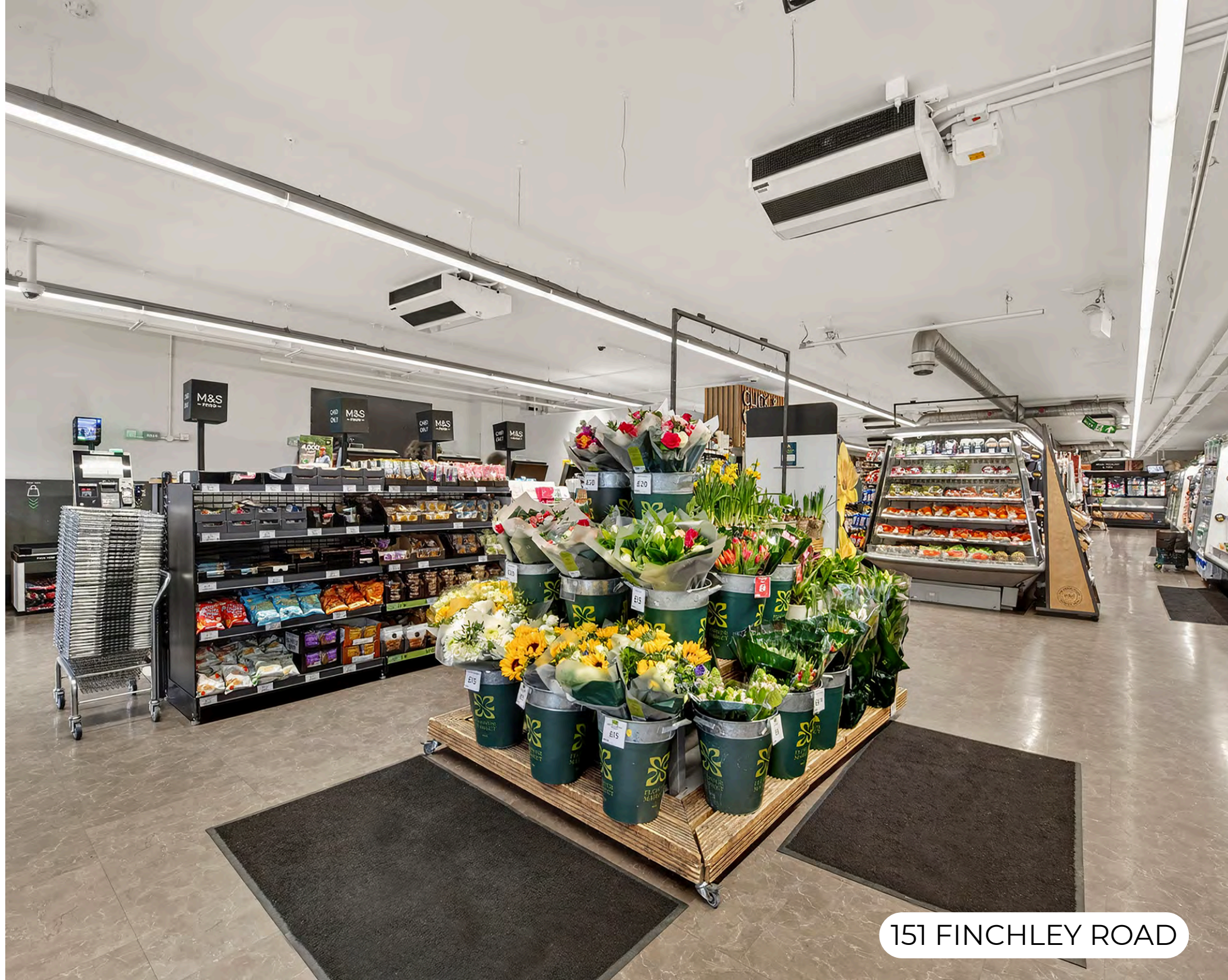
151 FINCHLEY ROAD