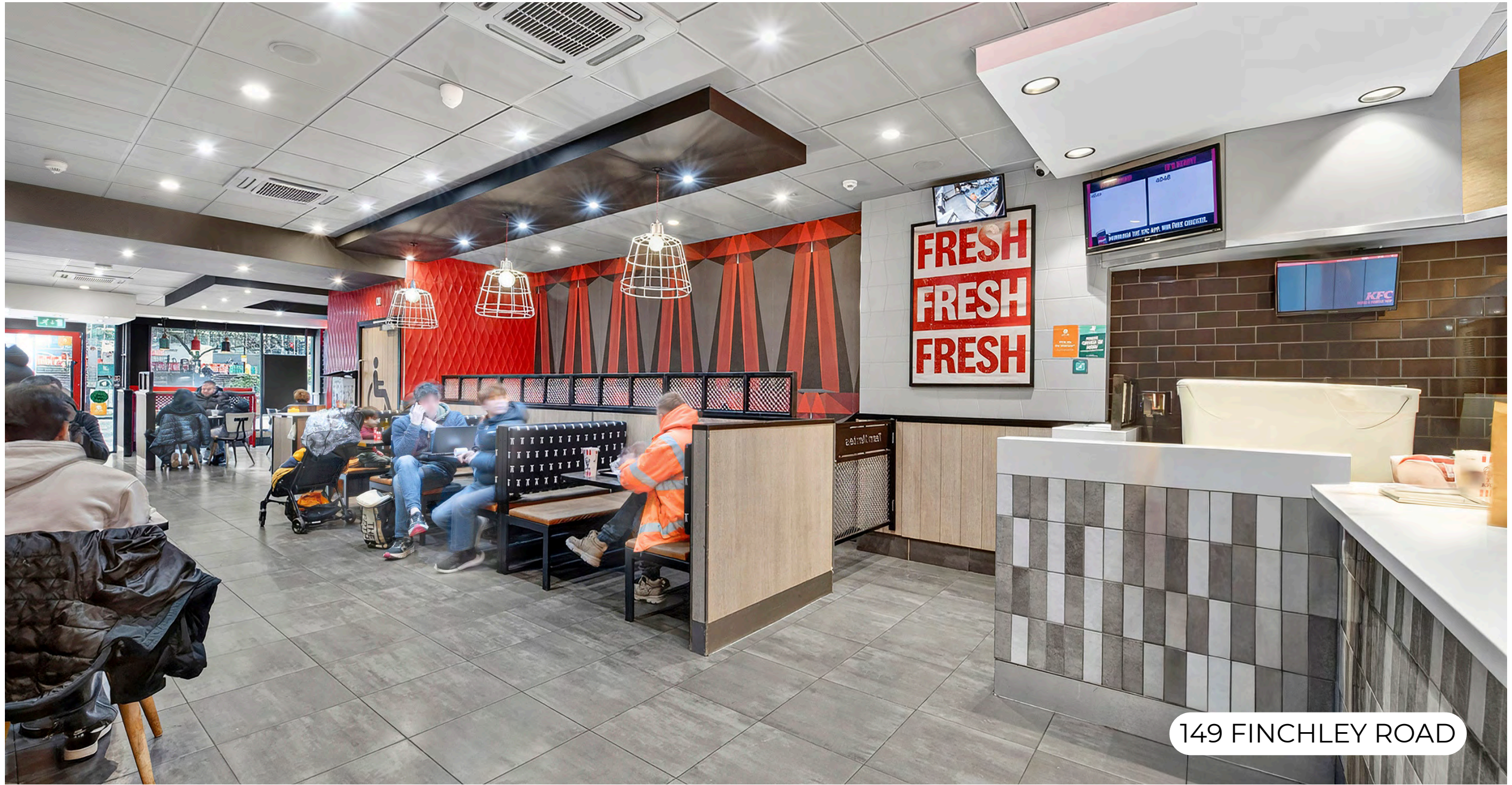
149 FINCHLEY ROAD