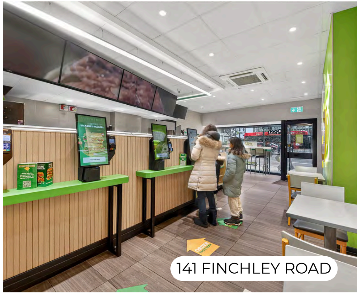
141 FINCHLEY ROAD