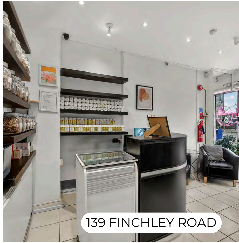
139 FINCHLEY ROAD