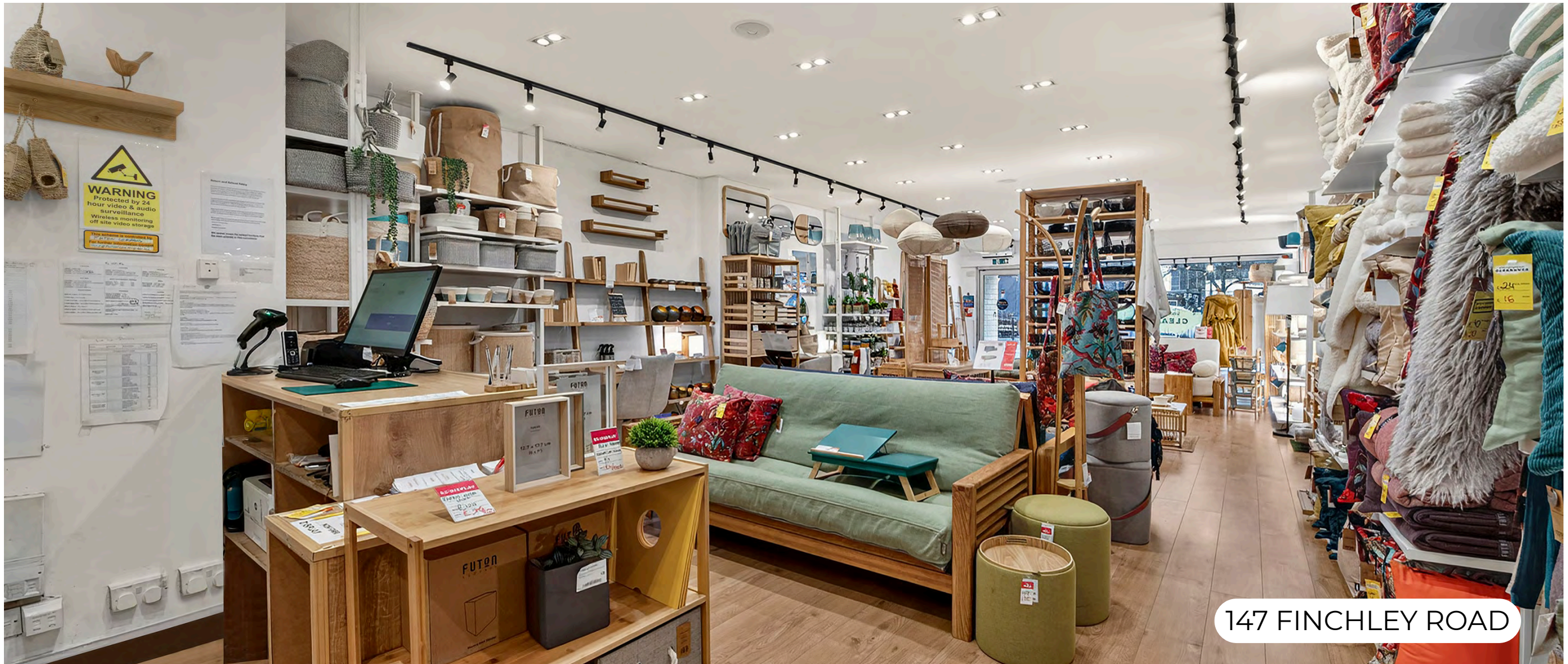
147 FINCHLEY ROAD