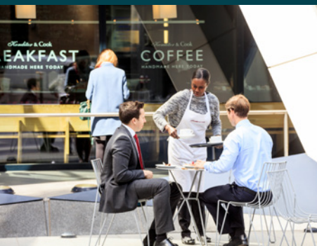
Indicative CGI images, subject to build and final specification