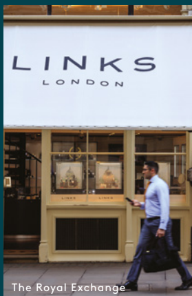
The Royal Exchange