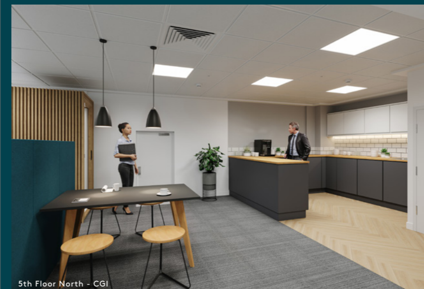
5th Floor North - CGI