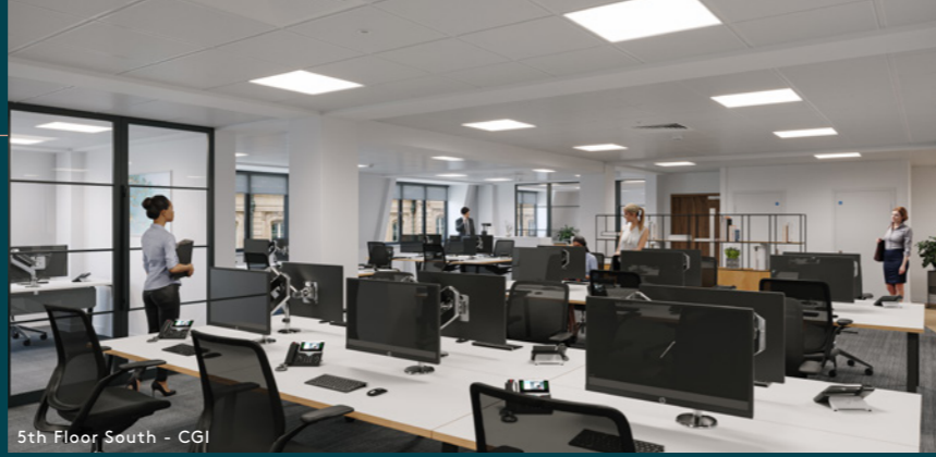
5th Floor South - CGI

Marlow House offers the opportunity to create stunning office space to suit the needs of your business.