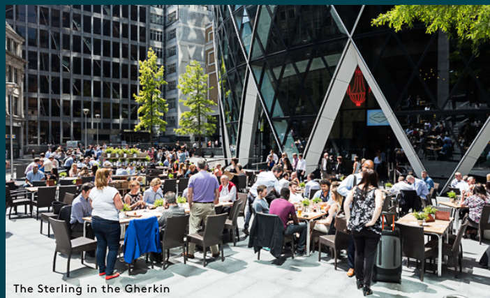
The Sterling in the Gherkin