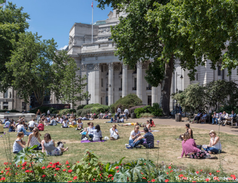
Trinity Square Gardens