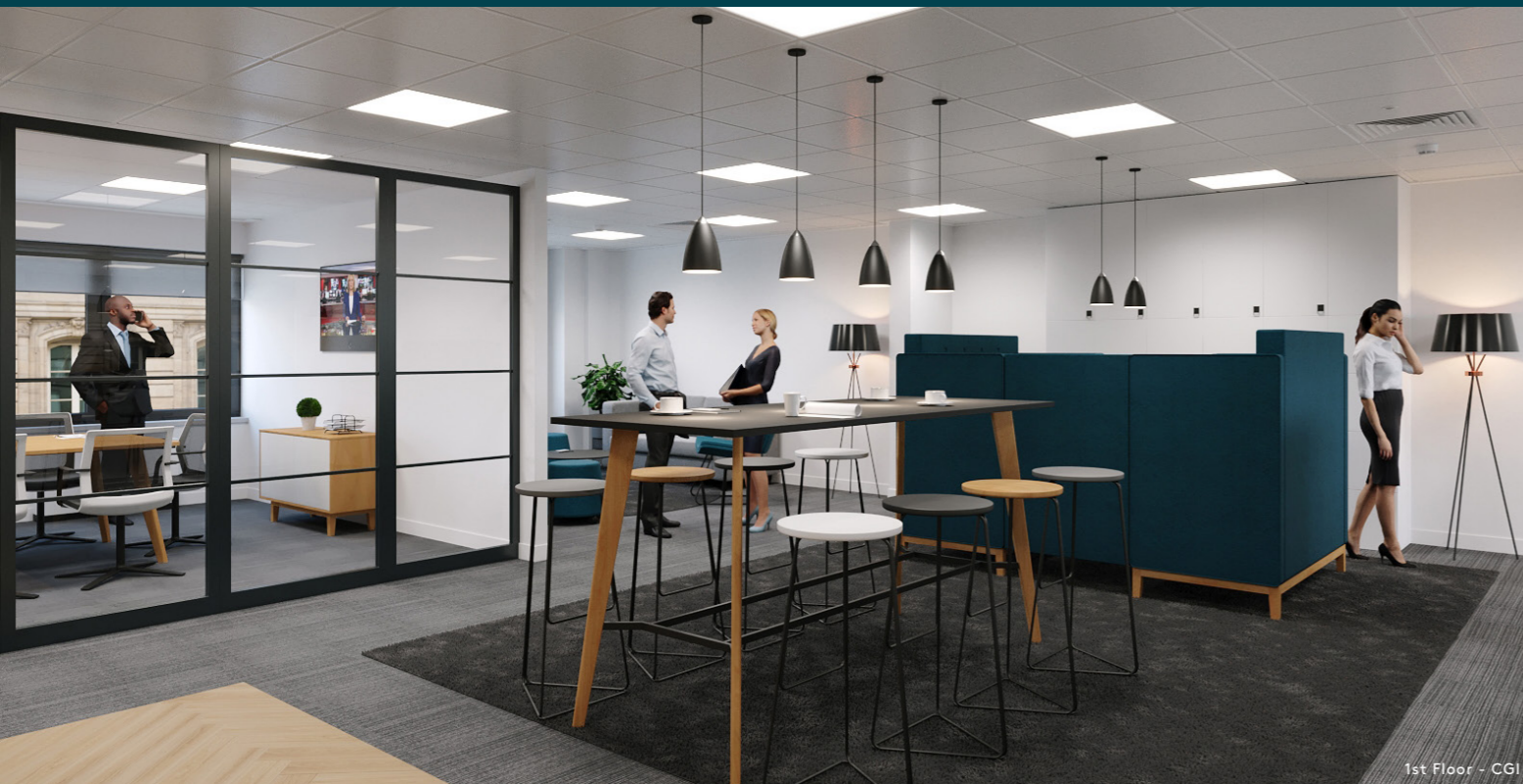
1st Floor - CGI