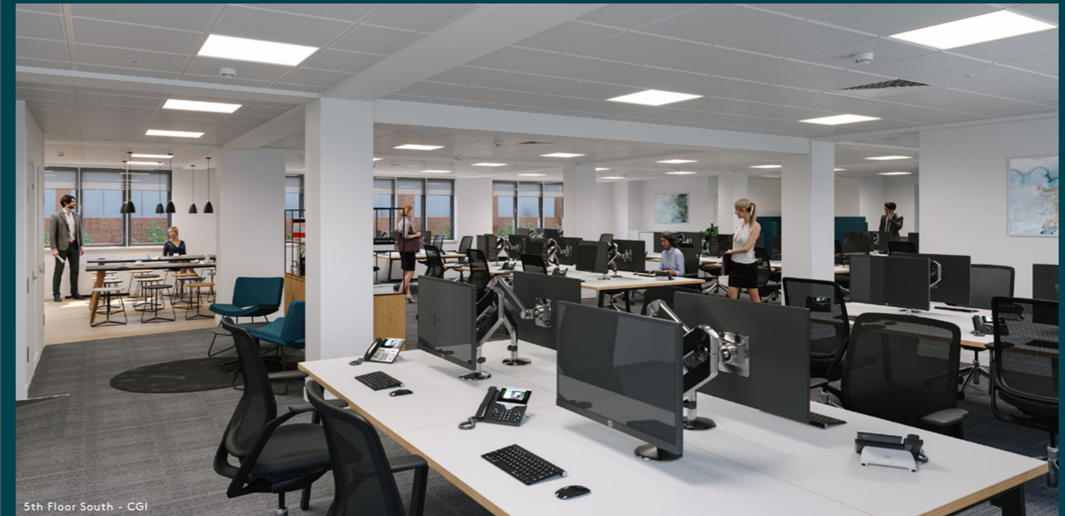
5th Floor South - CGI