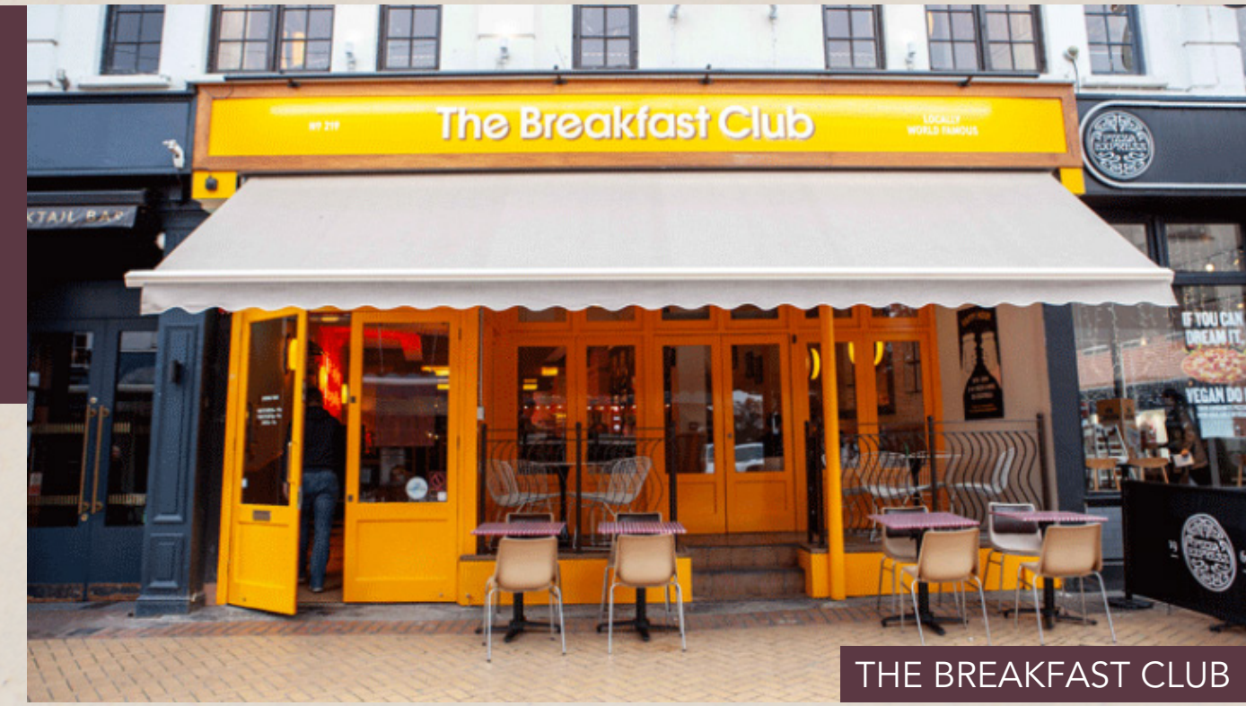
THE BREAKFAST CLUB