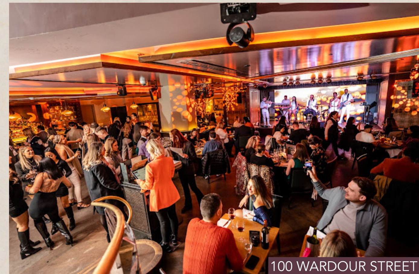
100 WARDOUR STREET