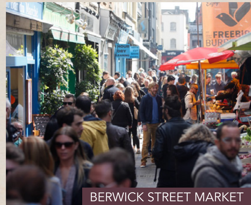
BERWICK STREET MARKET