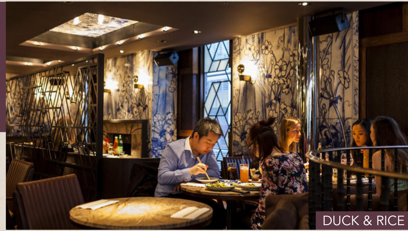
DUCK & RICE

The premises situates in the heart of Soho and benefits from a vibrant culture and mix of restaurants, bars and a constant buzz.