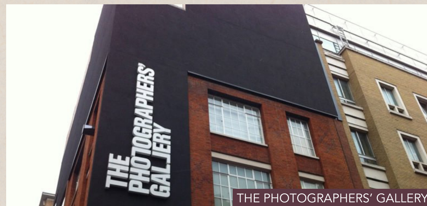
THE PHOTOGRAPHERS' GALLERY