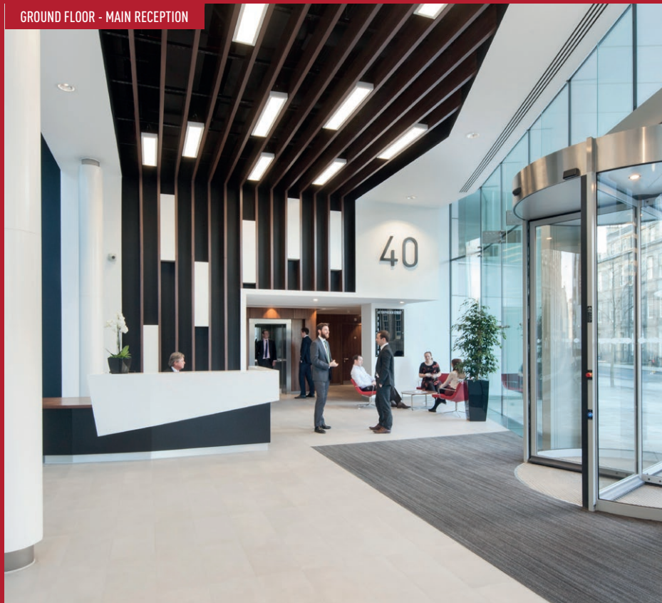
GROUND FLOOR - MAIN RECEPTION