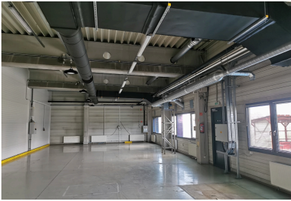
Production hall — full span