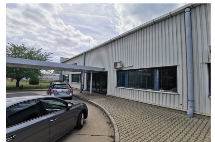
Covered entrance & parking