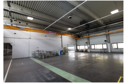
Workshop bay — 1.5t crane