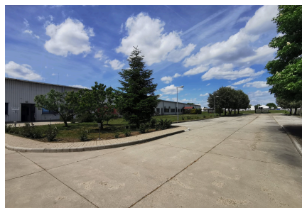
Landscaped grounds & yard