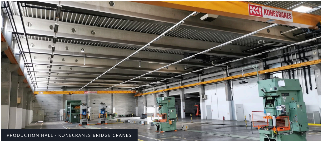
PRODUCTION HALL · KONECRANES BRIDGE CRANES

An outstanding opportunity to acquire a well-maintained, crane-equipped manufacturing facility situated within an established industrial zone in Dunaújváros, Central Hungary.