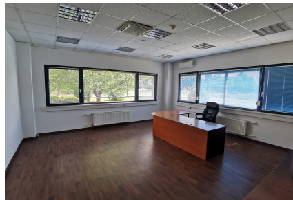
Private office suite