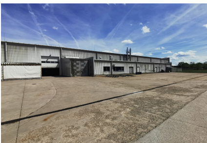
Background facade — full length