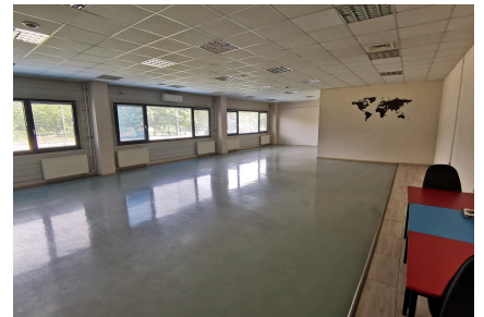
Dining area — bright interior