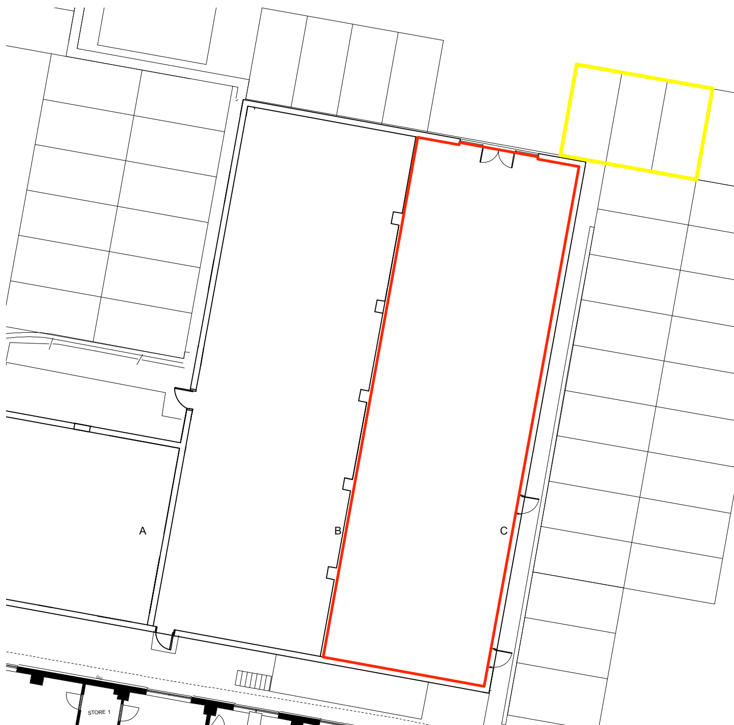
2 Ground Floor Plan Scale: 1:200