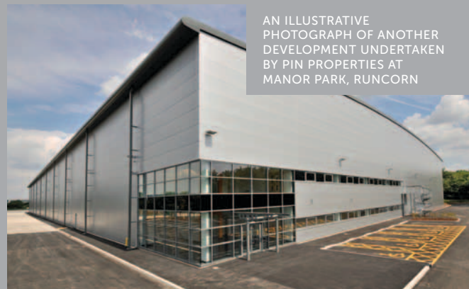
AN ILLUSTRATIVE PHOTOGRAPH OF ANOTHER DEVELOPMENT UNDERTAKEN BY PIN PROPERTIES AT MANOR PARK, RUNCORN