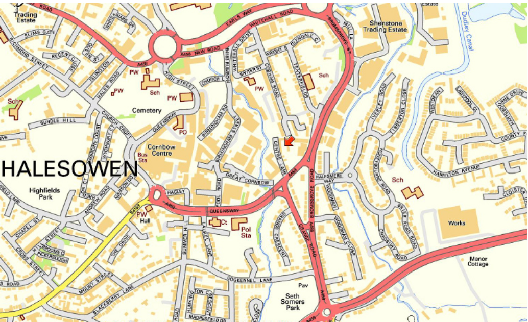
Licence Number - 100022432 - Not to Scale

Strictly by prior arrangement with the agent.