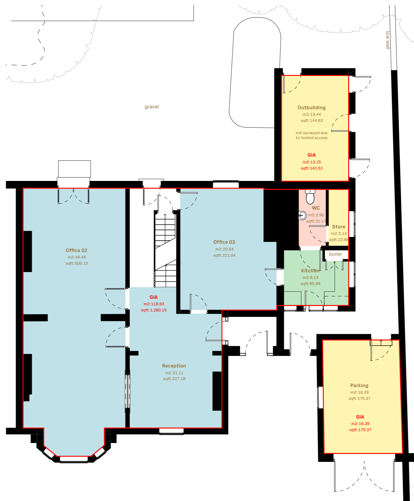
Ground Floor Scale: 1:100

129 Zellig, Custard Factory, Birmingham B9 4AT hello@sculpt.design | sculpt.design | 0121 663 1313