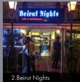
2. Beirut Nights