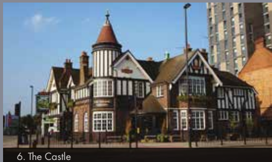
6. The Castle