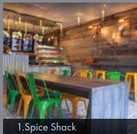
1. Spice Shack