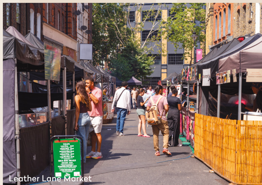
Leather Lane Market