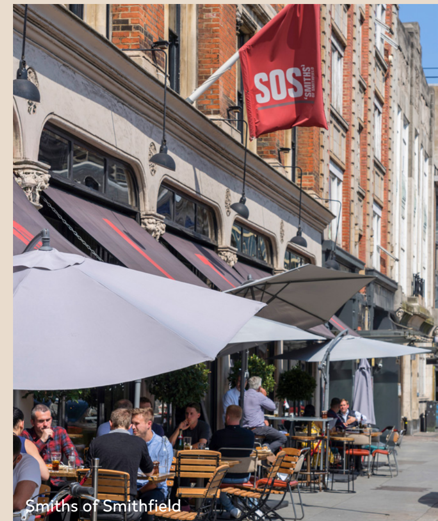
Smiths of Smithfield