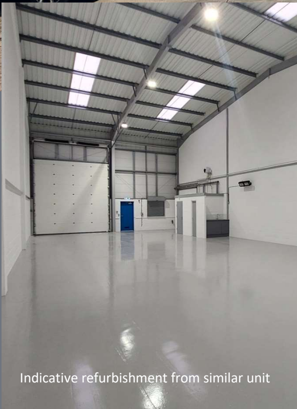
Indicative refurbishment from similar unit

Trade Counter / Warehouse Unit - To be refurbished