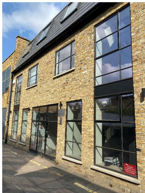
Images: newly refurbished skylight ceiling and mews building entrance