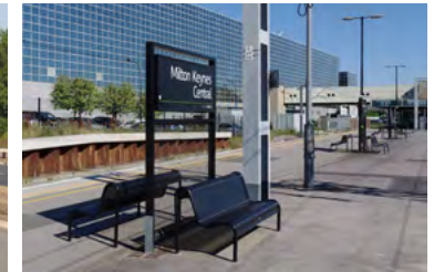
Milton Keynes Central - 3 miles

DISCLAIMER: The Agents for themselves and for the vendors or lessors of the property whose agents they are give notice that, (i) these particulars are given without responsibility of The Agents or the Vendors or Lessors as a general outline only, for the guidance of prospective purchasers or tenants, and do not constitute the whole or any part of an offer or contract; (ii) The Agents cannot guarantee the accuracy of any description, dimension, references to condition, necessary permissions for use and occupation and other details contained herein and any prospective purchasers or tenants should not rely on them as statements or representations of fact but must satisfy themselves by inspection or otherwise as to the accuracy of each of them; (iii) no employee of The Agents has any authority to make or give any representation or enter into any contract whatsoever in relation to the property; (iv) VAT may be payable on the purchase price and / or rent, all figures are exclusive of VAT, intending purchasers or lessees must satisfy themselves as to the applicable VAT position, if necessary by taking appropriate professional advice; (v) The Agents will not be liable, in negligence or otherwise, for any loss arising from the use of these particulars. 10.16.