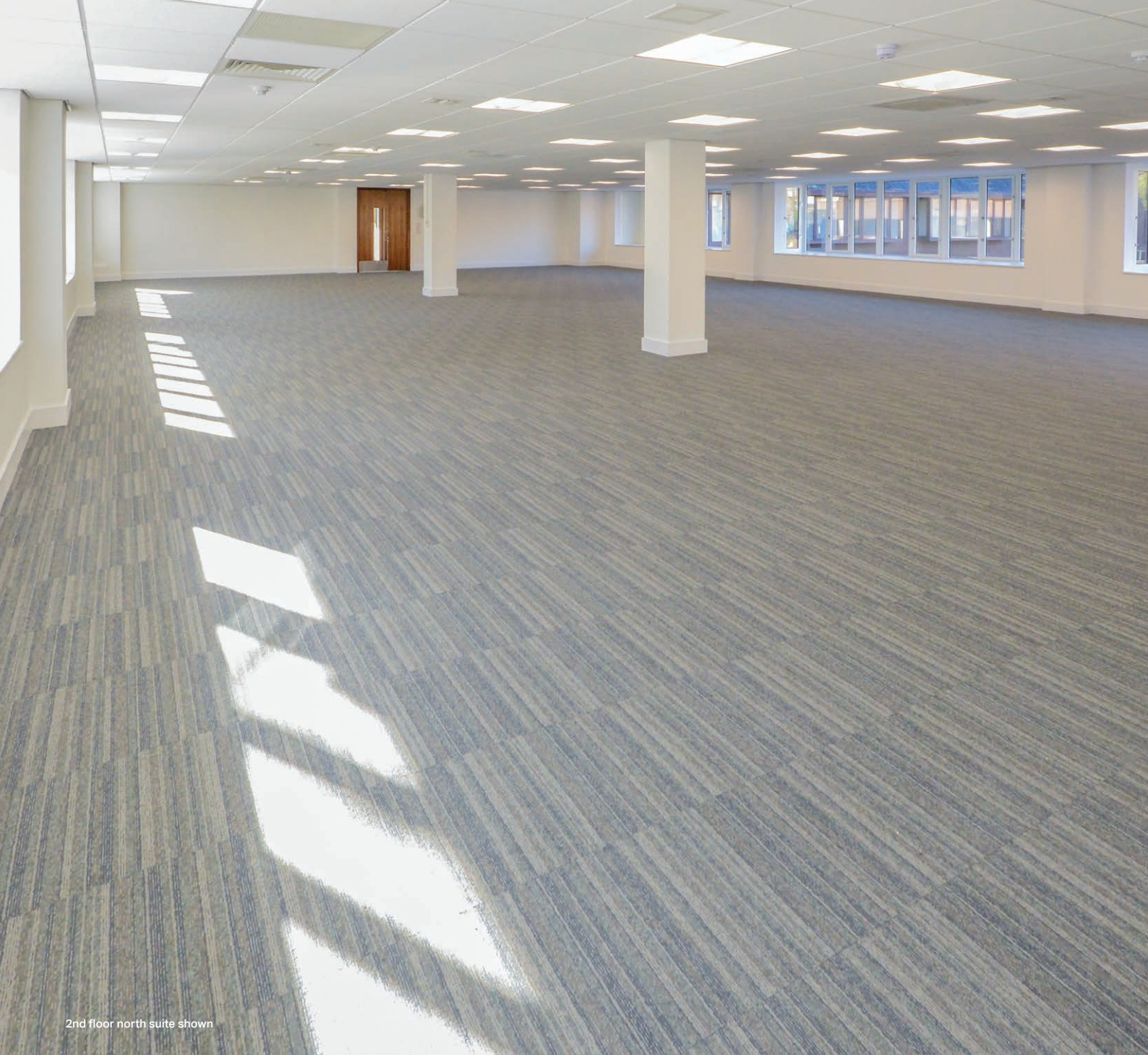
2nd floor north suite shown