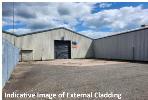
Indicative Image of External Cladding