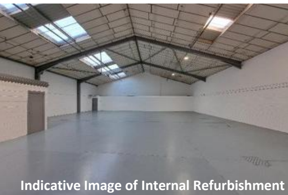
Indicative Image of Internal Refurbishment