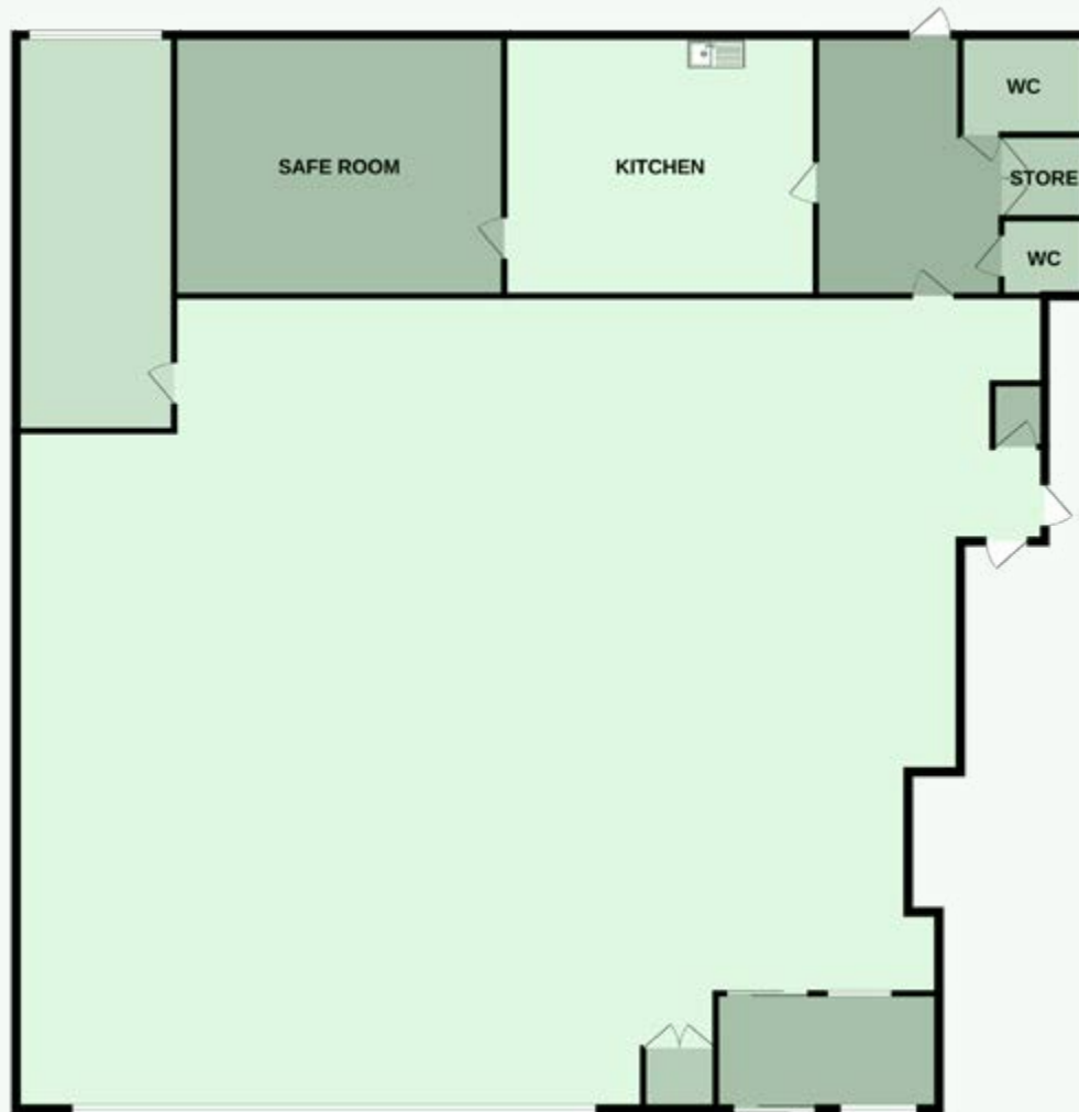
Plan not to scale, illustration only