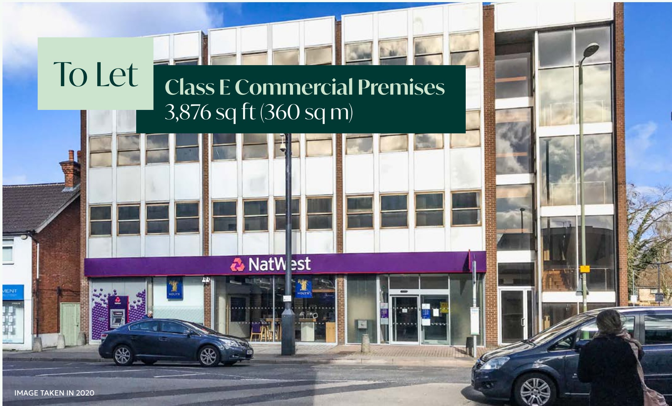
IMAGE TAKEN IN 2020

Class E Commercial Premises 3,876 sq ft (360 sq m)