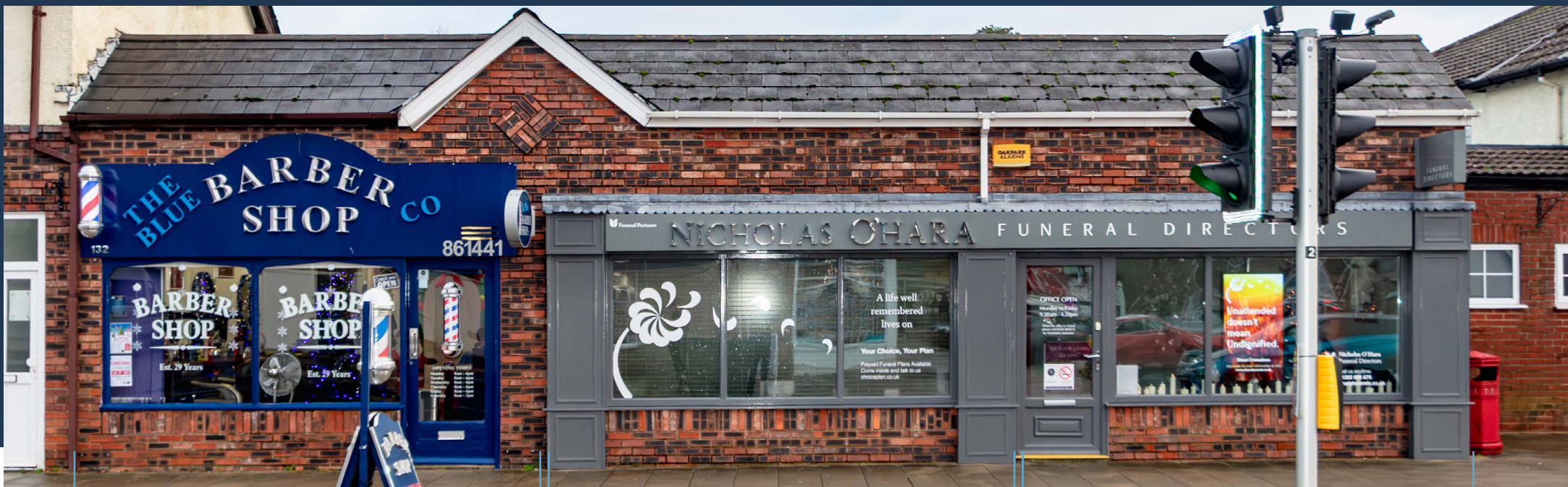
132 STATION ROAD