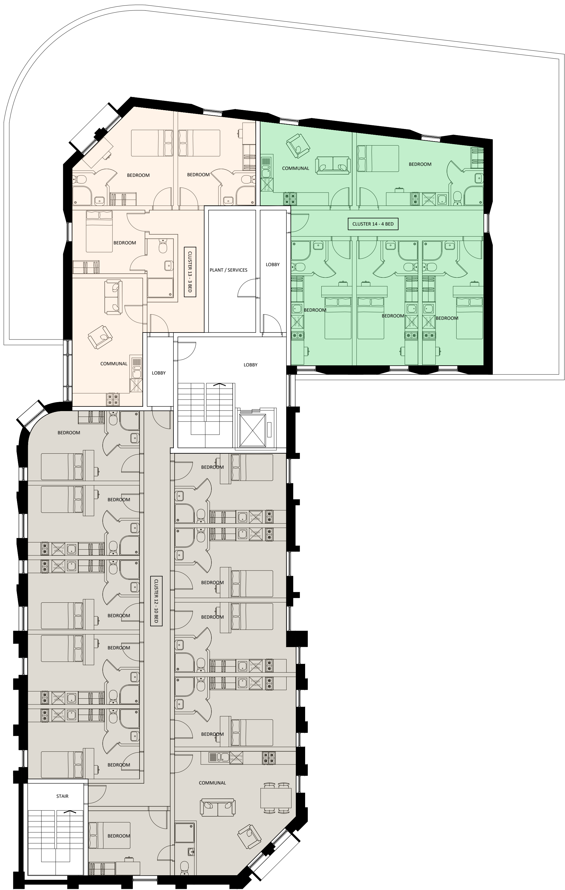
Fourth Floor Plan Scale 1:100