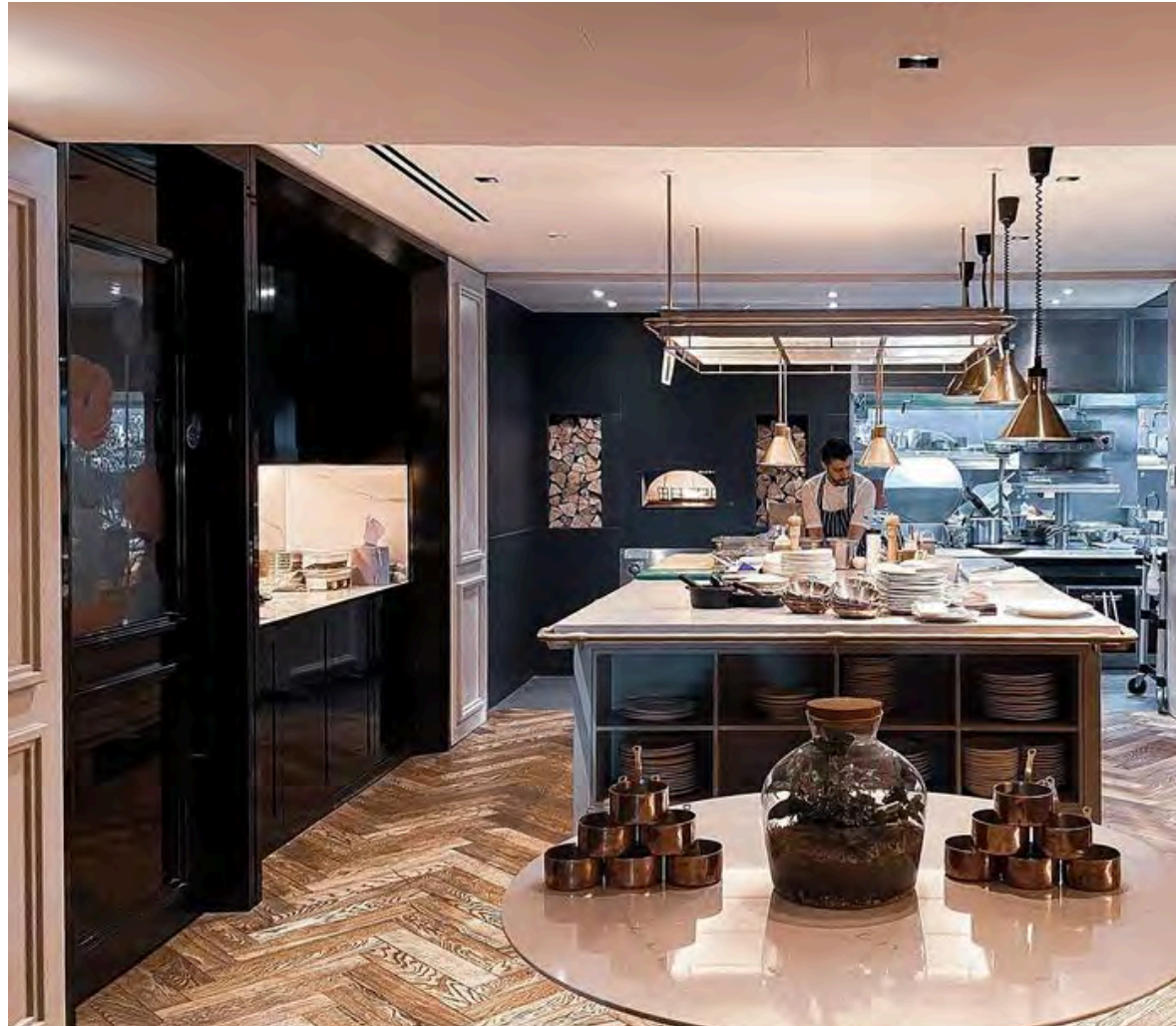
The Kitchen at Holmes