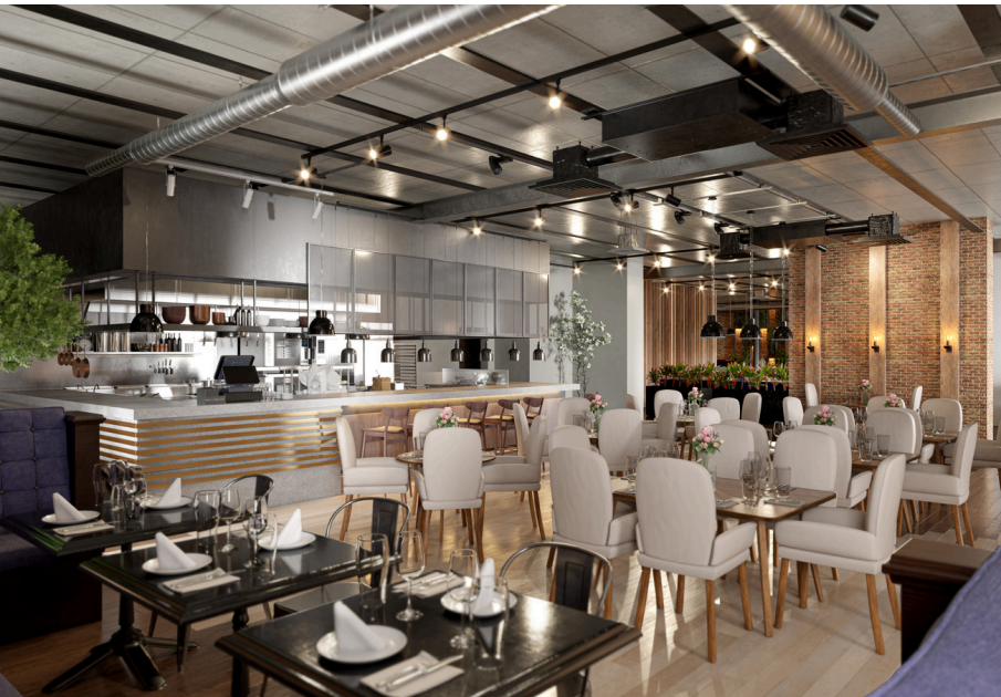
CGI Images illustrative Purposes Only

Units 1 & 2 is set to complete in February 2025, with scaffolding set to be taken down May 2025. Unit 3 is set to be complete Summer 2026. The units will be let/ sold in a shell and core condition with capped services located at the rear of the unit(s).