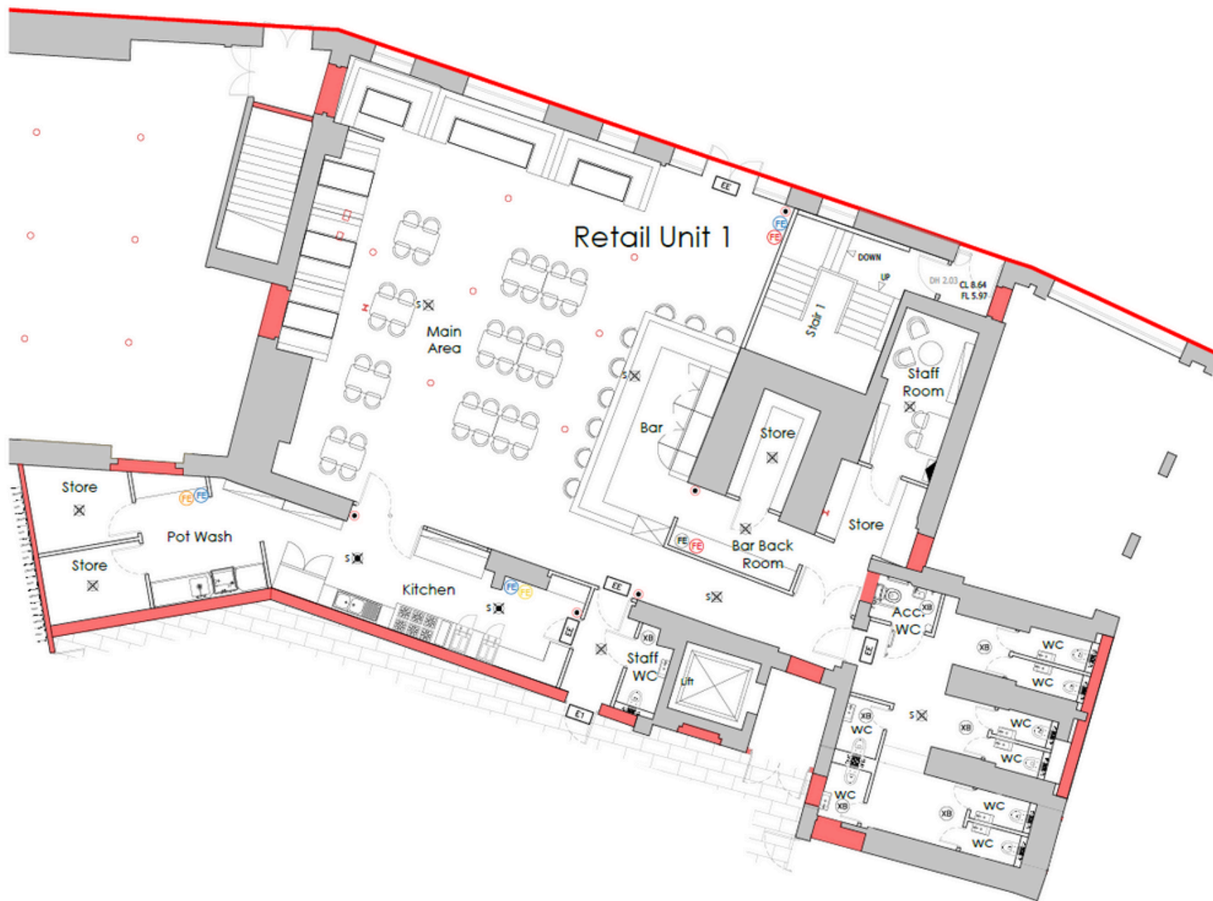
Indicative Premises Drawings