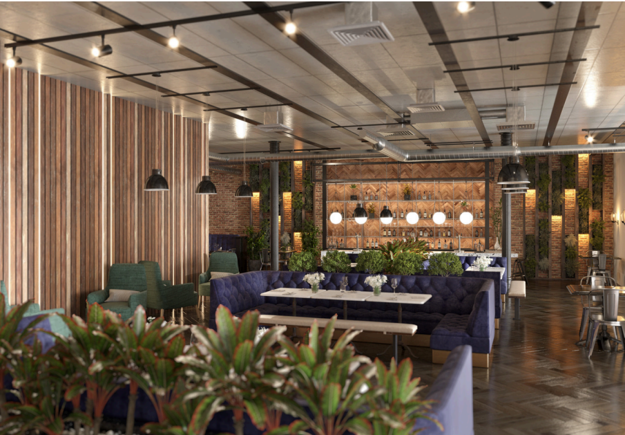
CGI Images illustrative Purposes Only