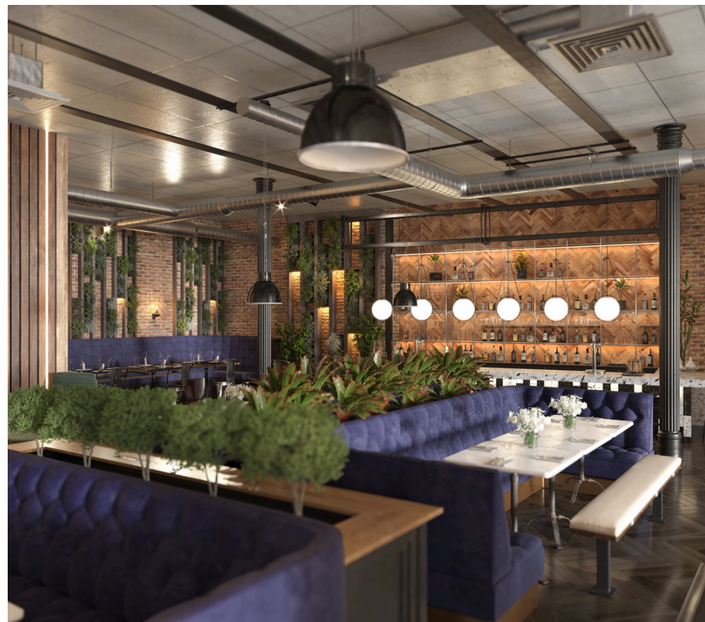
CGI Images illustrative Purposes Only

Money Laundering Regulations require Savills to conduct checks upon all purchasers. Prospective purchasers will need to provide proof of identity and residence.