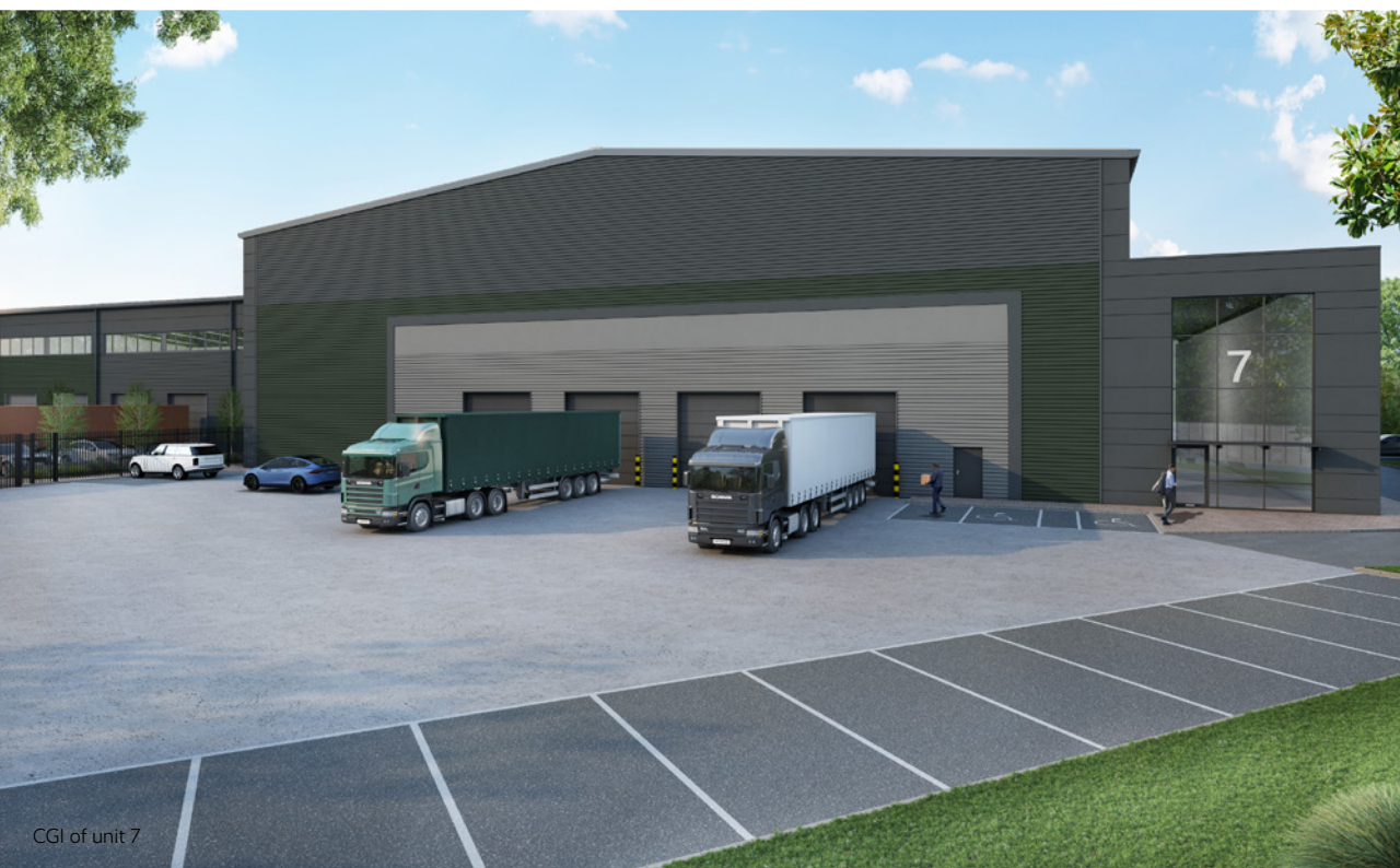
CGI of unit 7