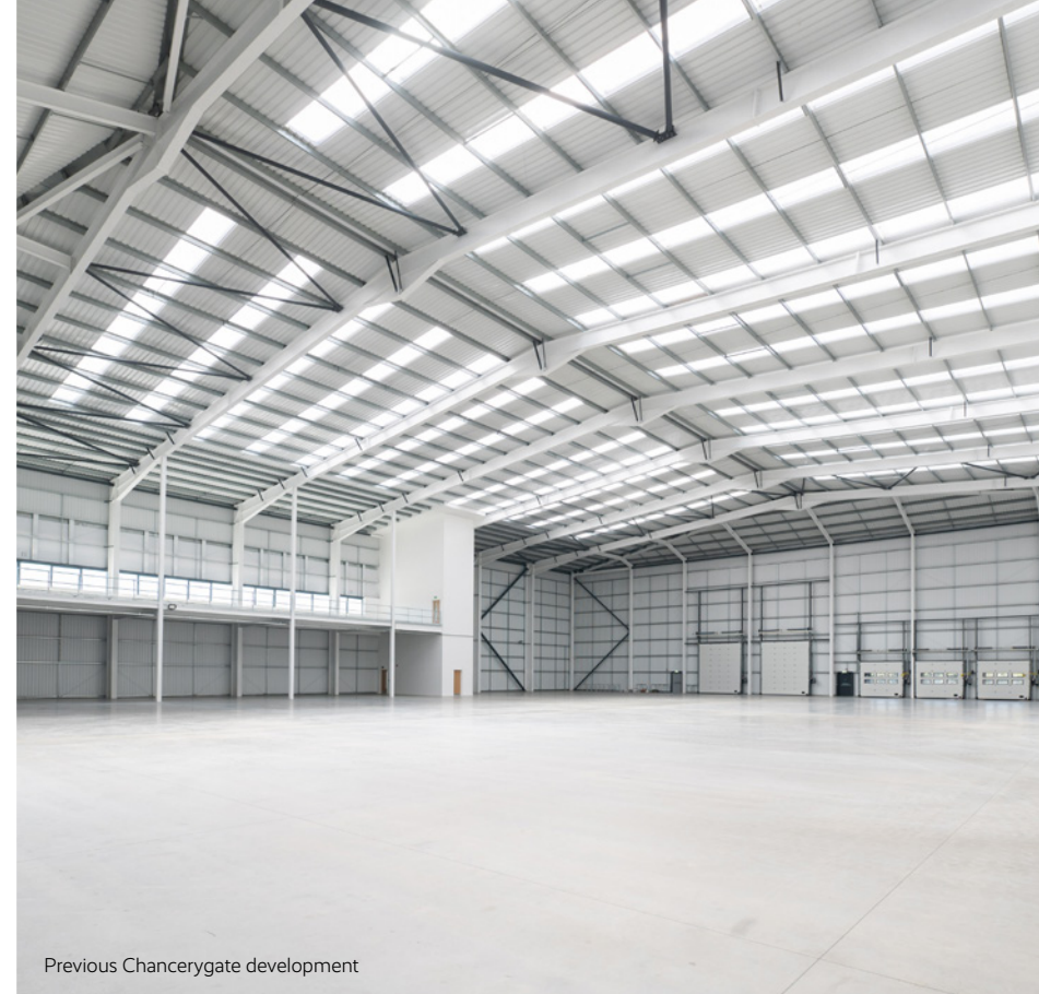
Previous Chancerygate development