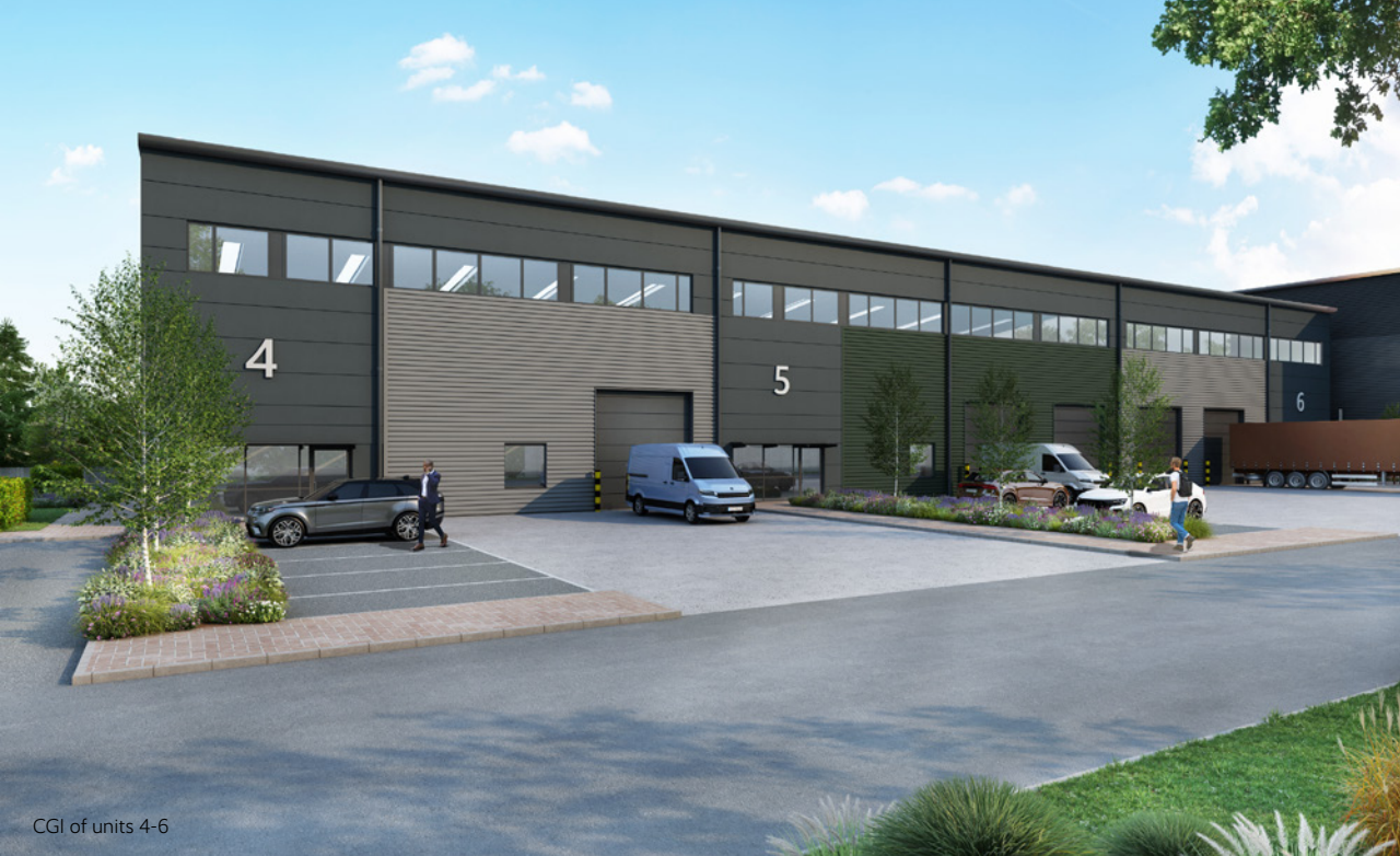
CGI of units 4-6