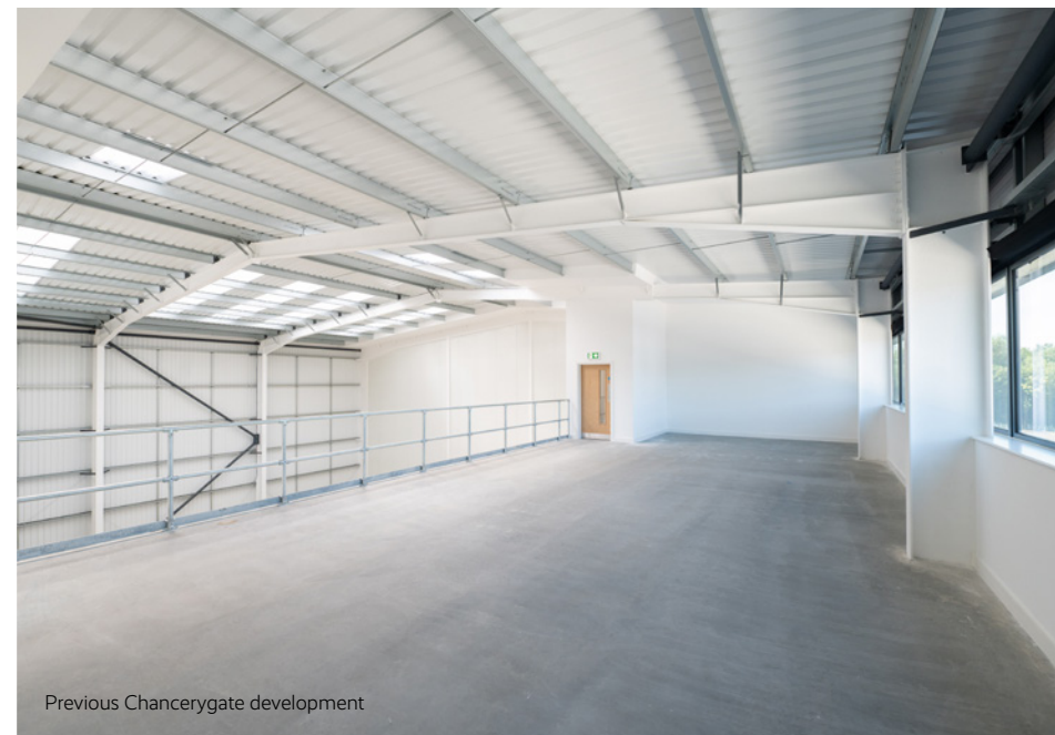
Previous Chancerygate development