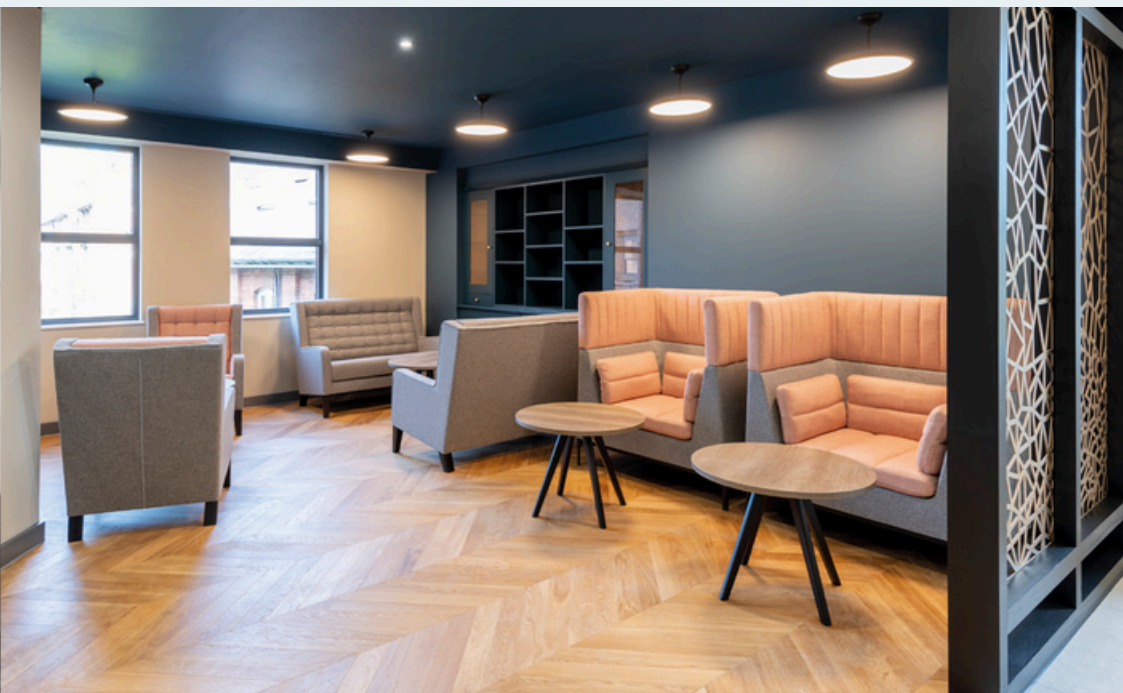
Above: Refurbished ground floor meeting area.