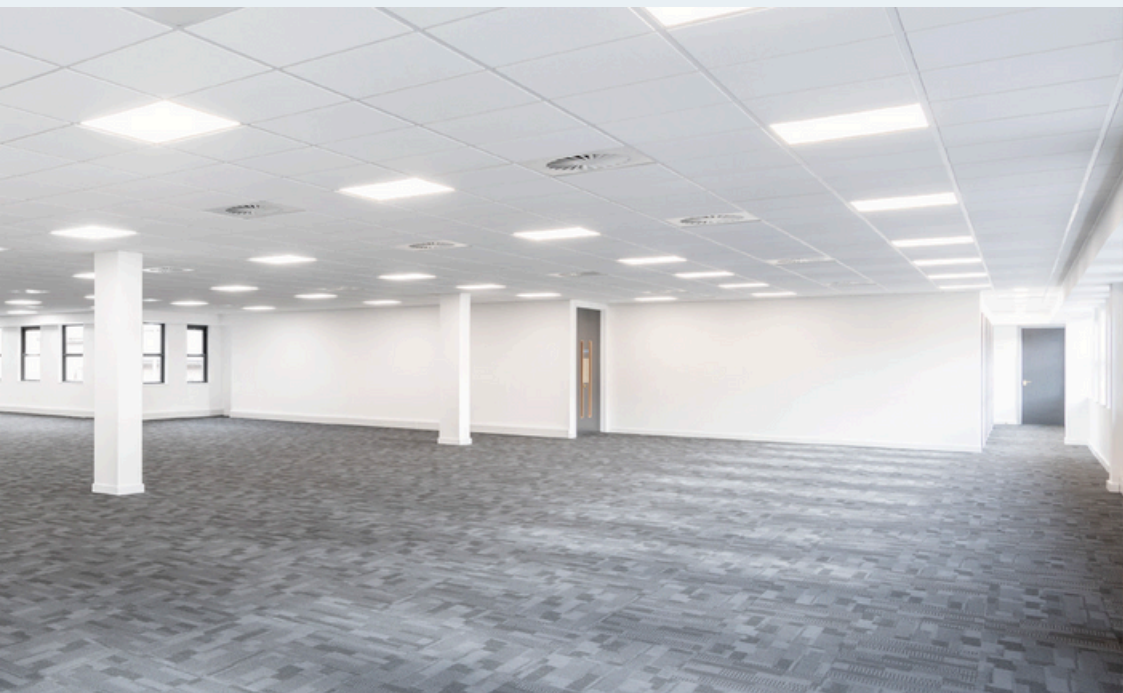
Above: Refurbished open plan office space.