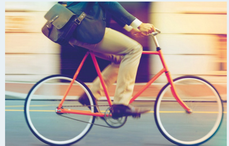
Top: Winchester Christmas market with stalls lining the high street. Middle: Enjoying a coffee at one of the many restaurants and cafés. Above: The smart way to get about in Winchester.