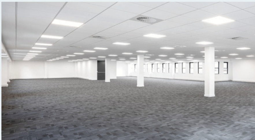
Top: Refurbished ground floor reception. Above: Refurbished open plan office space.

The infrastructure of every floor has been designed with flexibility in mind - so you can create the perfect environment for your business and your team. The latest LED lighting provides a cleaner light and dramatically reduces energy consumption. Air conditioning allows for independent heating/cooling where and when you need it and the raised floor access gives you the flexibility to configure the workspace to your precise requirements. Finally, onsite cameras provide the security your company needs.