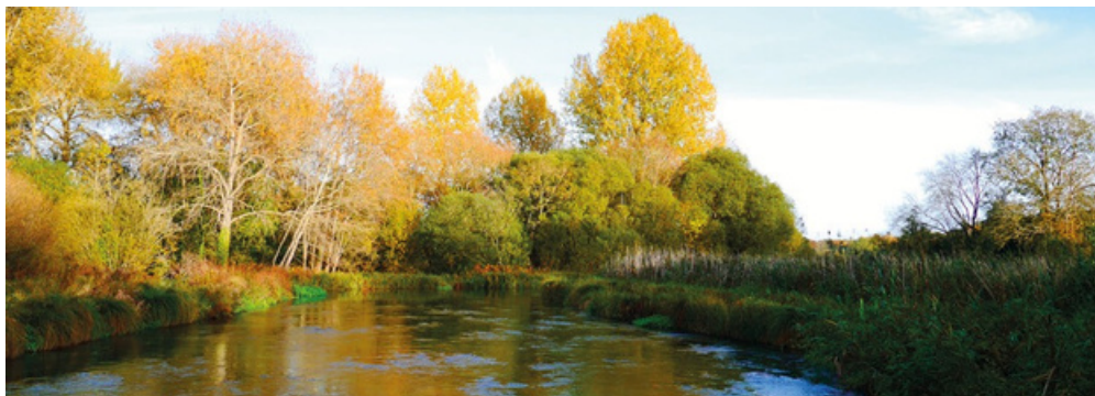
Above: Winchester water meadows.

Located at the western edge of the South Downs National Park, on the River Itchen, Winchester benefits from being close to the M3 and the entire UK motorway network. Wykeham Court is positioned just a five-minute walk from Winchester Train Station. From there London Waterloo is only 70 minutes away and Southampton Central Station just a 20-minute train ride. This makes Wykeham Court ideally located for commuting and enables businesses to successfully cast their employment net further afield ensuring a reliable source of qualified and experienced employees who want to work in Winchester.