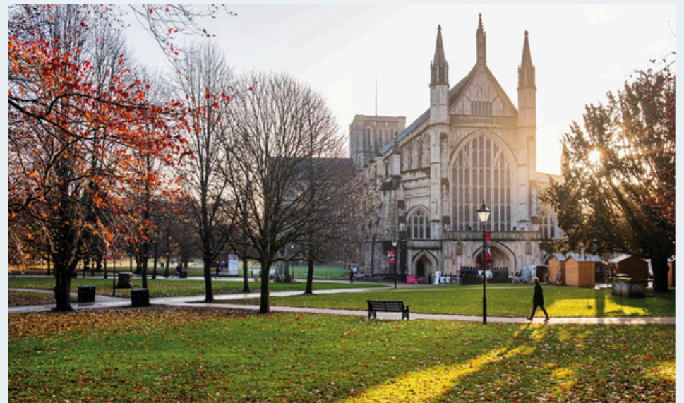
Top: Entrance to Wykeham Court. Above: Winchester Cathedral.