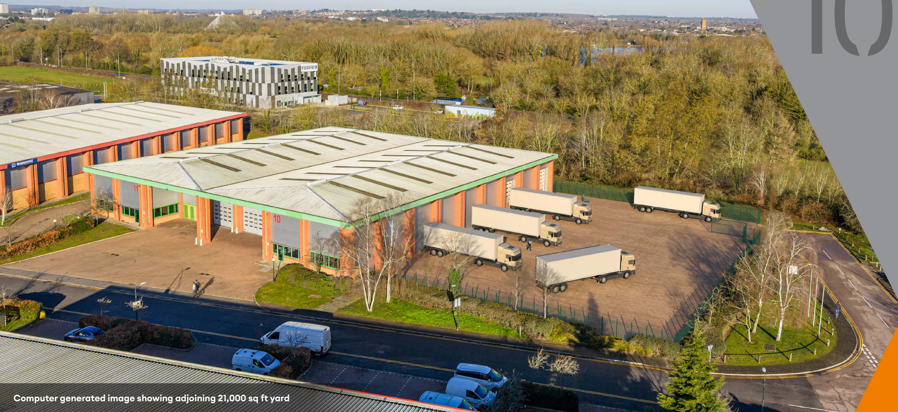
Computer generated image showing adjoining 21,000 sq ft yard