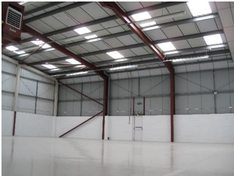
Indicative images of a refurbished property on the estate

The property comprises a warehouse / industrial unit of steel portal frame construction with clad elevations and a pitched roof. The height to the apex is approximately 6.6m. Access to the property is via a full height up and over loading door or separate staff entrance.