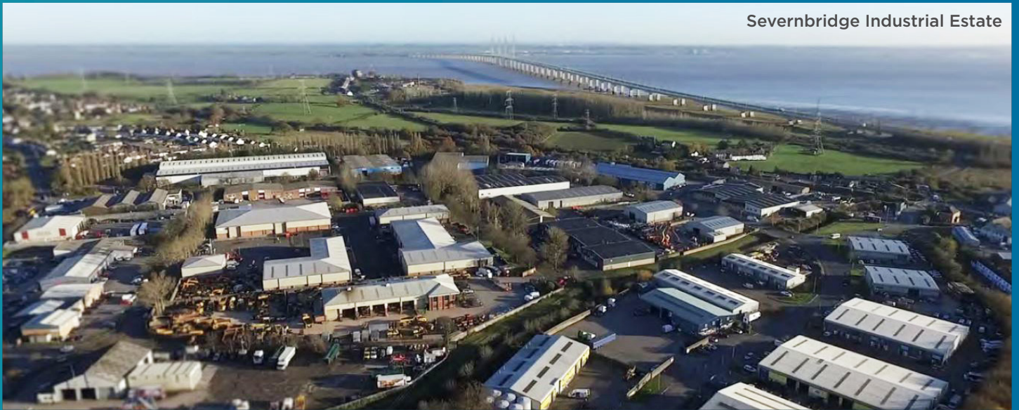
Severnbridge Industrial Estate