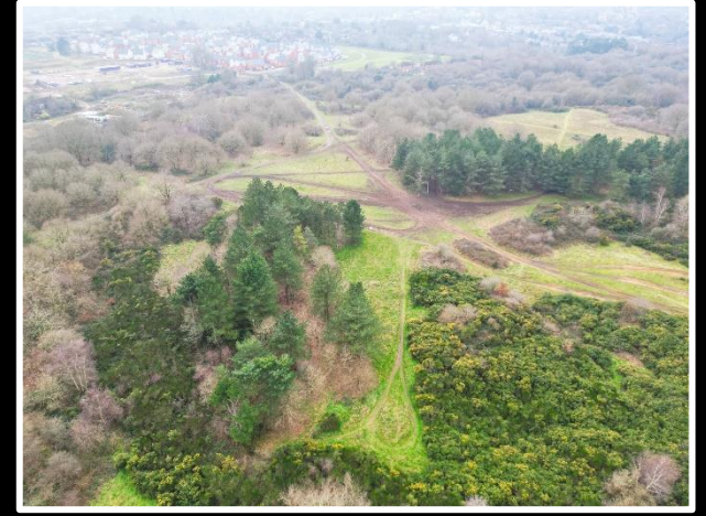
Area A – Facing South to Area C