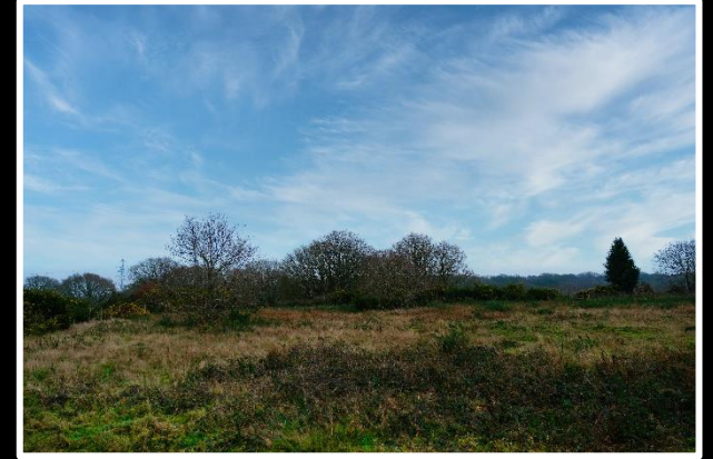
Area B – On the Ground