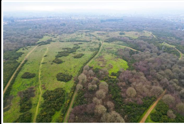
Area A – Facing West