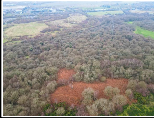
Area A & B – Facing North