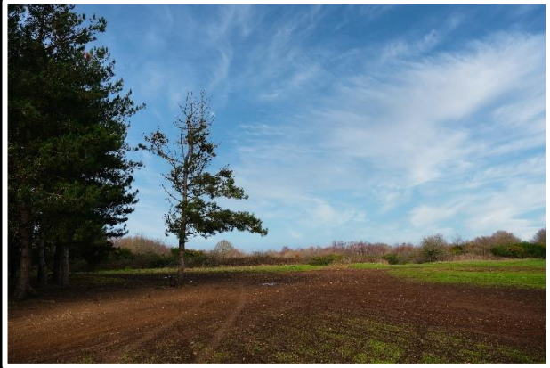
Area A - On the Ground