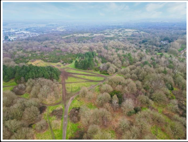
Area A – Facing East