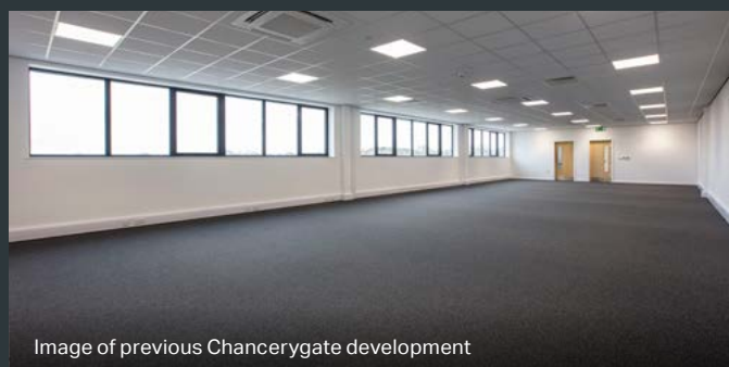
Image of previous Chancerygate development