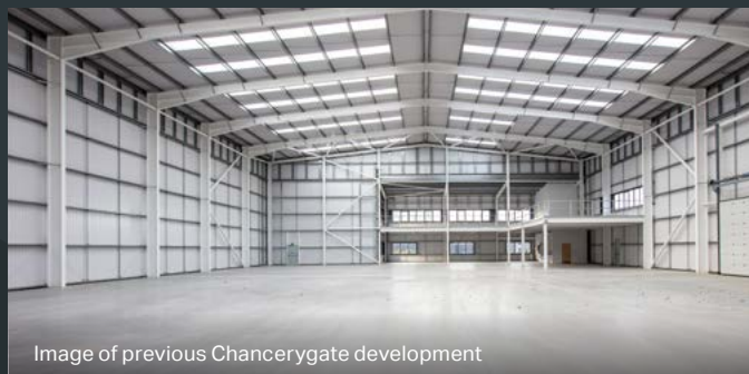
Image of previous Chancerygate development

More information available through the joint marketing agents: