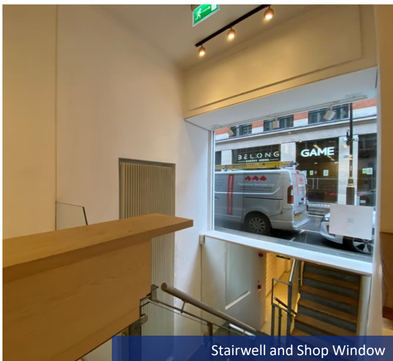
Stairwell and Shop Window