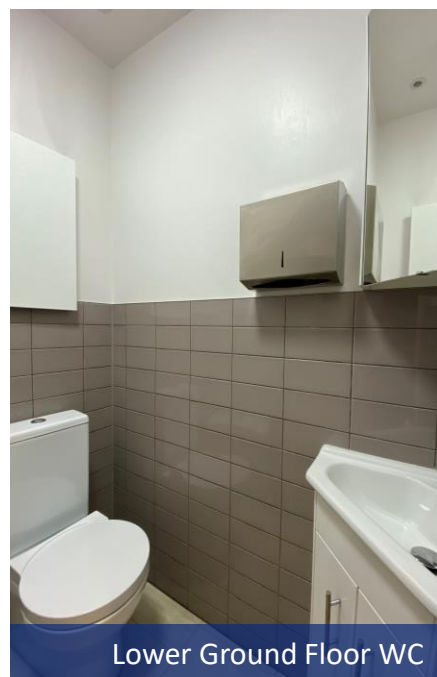
Lower Ground Floor WC