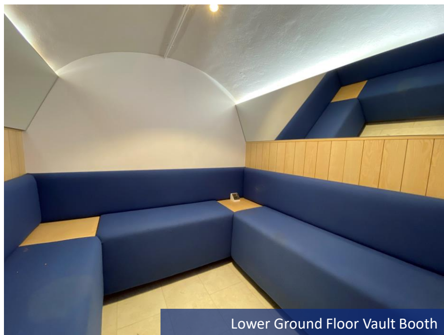
Lower Ground Floor Vault Booth