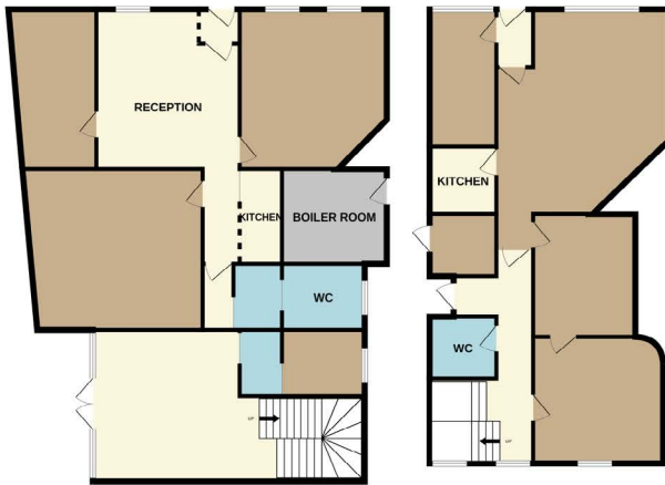
GROUND FLOOR 2372 sq.ft. (220.3 sq.m.) approx.