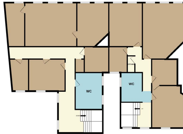
1ST FLOOR 2331 sq.ft. (216.5 sq.m.) approx.