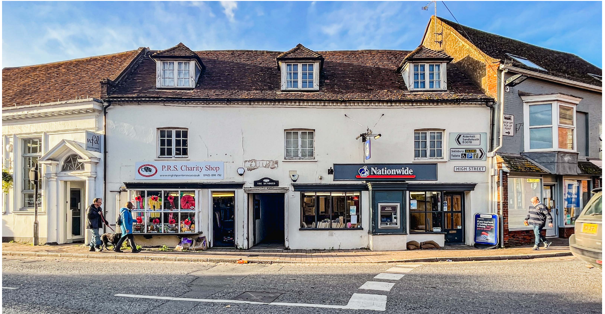
THE HUNDRED FORDINGBRIDGE, HAMPSHIRE SP6 1AA