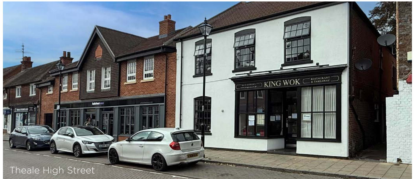
Theale High Street

Theale benefits from a thriving local economy, with a number of large businesses located in the wider area including Microsoft and Huawei.