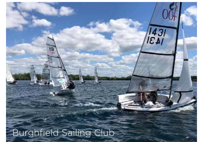
Burghfield Sailing Club