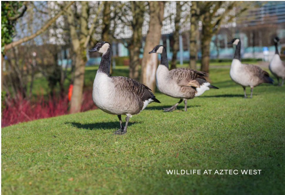
WILDLIFE AT AZTEC WEST