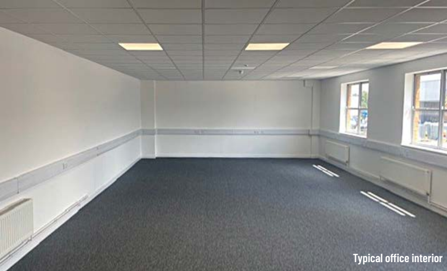
Typical office interior

The Heathrow Estate is located on Silver Jubilee Way at the Interchange of the A312 (The Parkway) and the A30 (Great South West Road). An established Heathrow industrial location that is 4 miles to the Cargo Terminal, 1.5 miles to M4 Junction 3, 1 mile to Hatton Cross Underground Station and 14 miles to Central London.