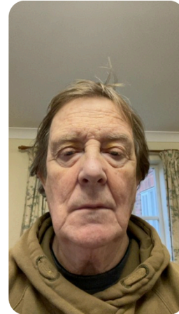
Source: Biometric liveness scan